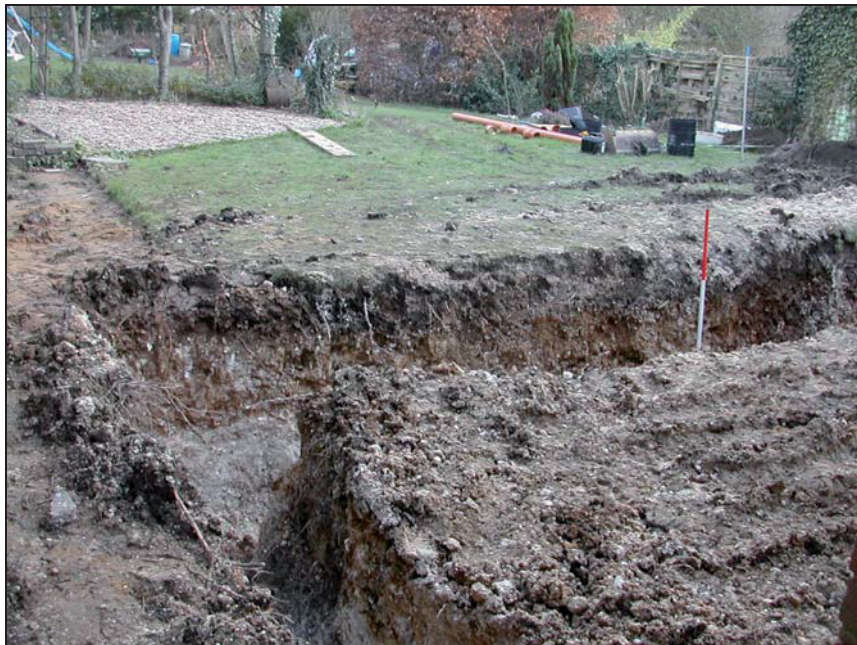
Plate 2: South eastern view of footing trench