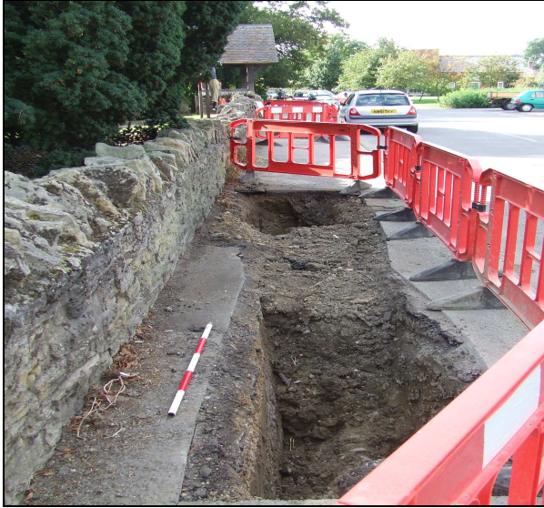
Plate 1: Looking NW up Court Road