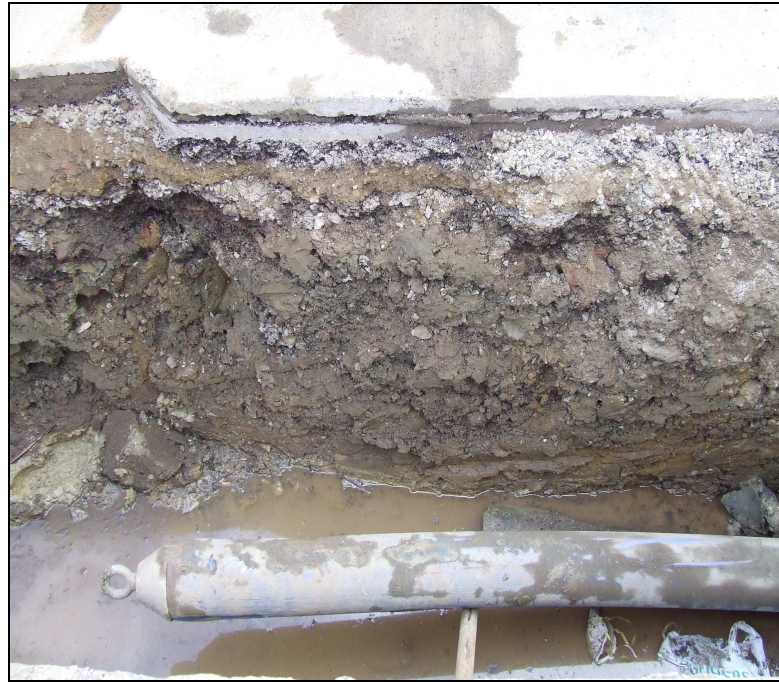
Plate 7: NW facing section of SW end of Rectory Lane