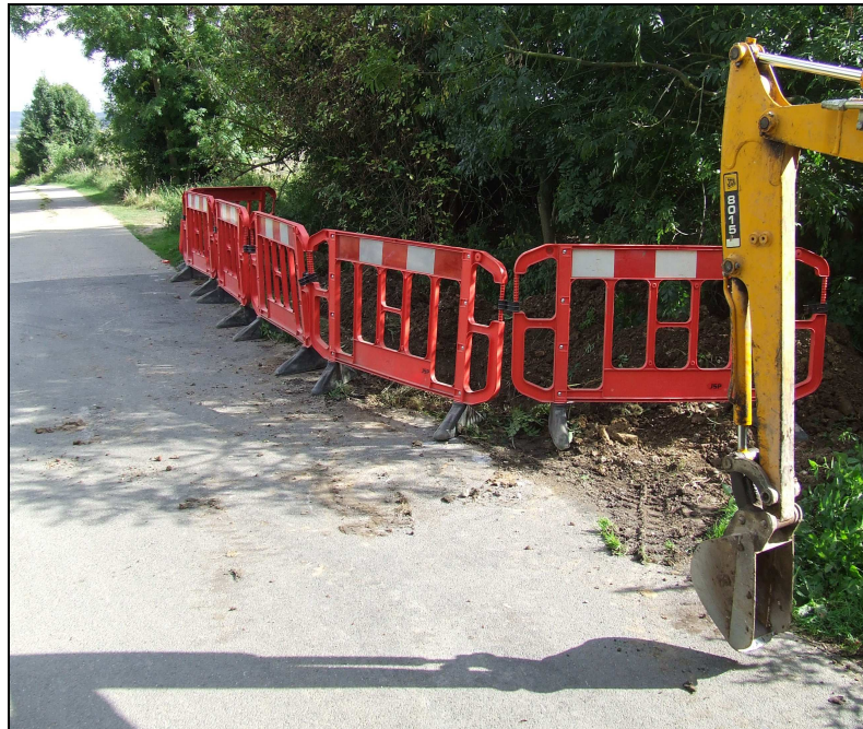
Plate 8: SE end of main replacement in Rectory Lane