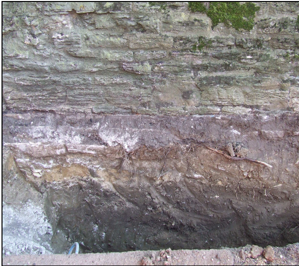
Plate 3: NE facing section of trench against church yard wall in Court Road