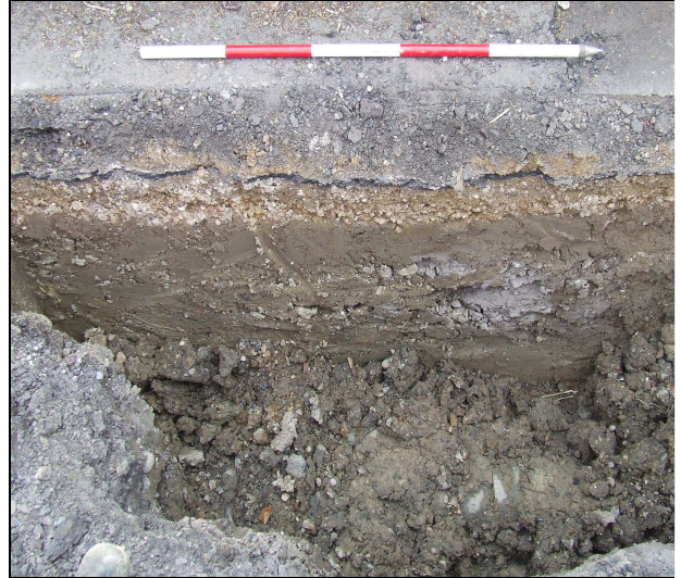
Plate 2: NE facing section of trench in Court Road near lych gate 1m scale