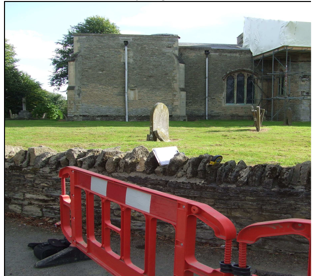
Plate 4: N corner of church from Court Road