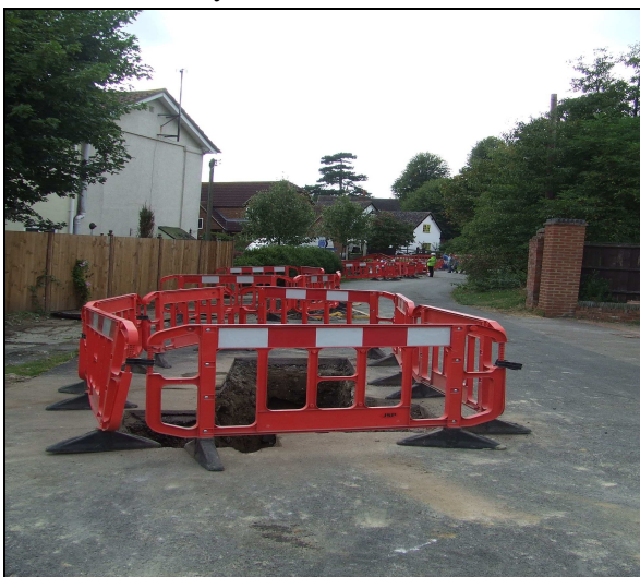
Plate 5: Looking E up Rectory Lane