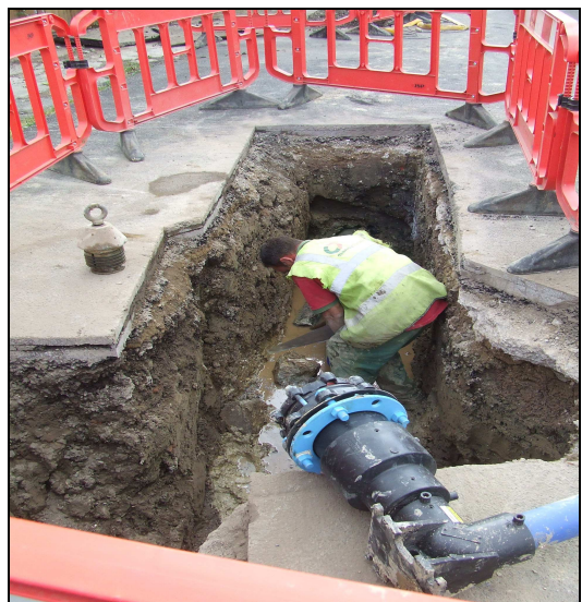
Plate 6: Fitter in action in Rectory Lane