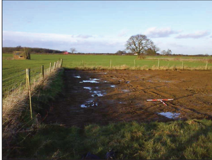
Plate 1: Western end of manege, looking north, 2x1m scale