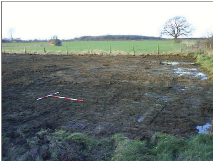
Plate 2: Eastern end of manege, looking north, 2x1m scale