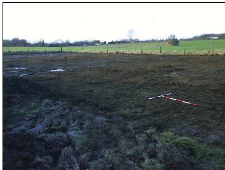
Plate 3: General view of manege, looking northwest, 2x1m scale