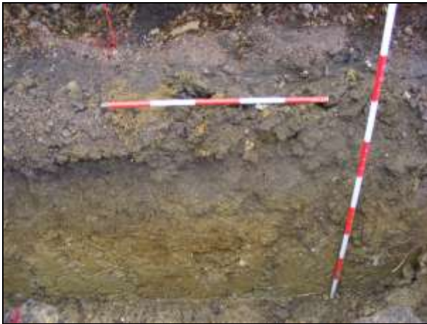
Plate 1: Footing trench stratigraphy, looking northeast

Ground reduction took place across an area west of service trench B. About 0.4m of made ground was removed to reveal the top of the orange brown subsoil layer. Brick walls were revealed in this area. All were of Fletton brick construction, bonded with cement mortar.