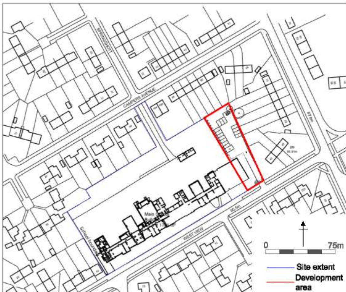
Figure 2: Site plan (scale 1:2500)

The proposed development comprises the construction of a new Children’s Centre and Pre-School with associated play area (Fig. 3).