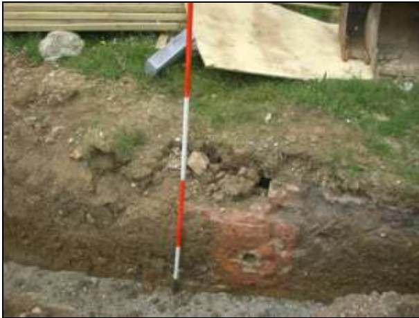
Plate 5: Wall within boundary wall footing trench, looking west