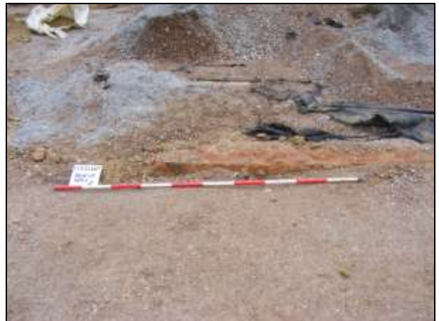
Plate 14: Brick foundations revealed within area of ground reduction