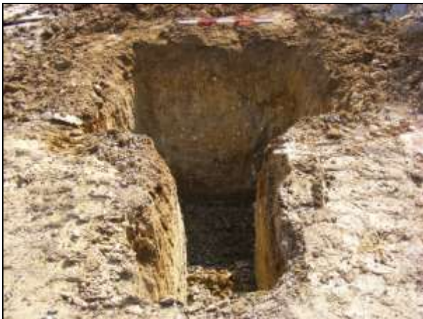
Plate 13: Manhole C, looking east