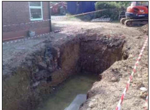
Plate 8: Soakaway 2, looking southeast