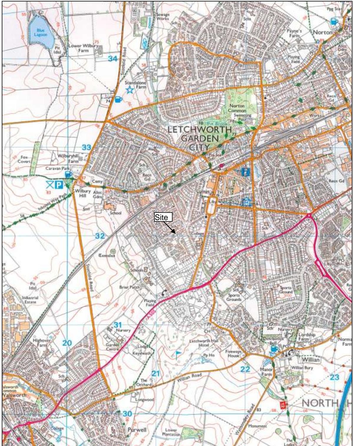
Figure 1: General location (scale 1:25,000)