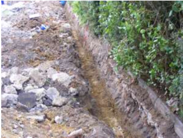
Plate 11: Service trench A, looking north