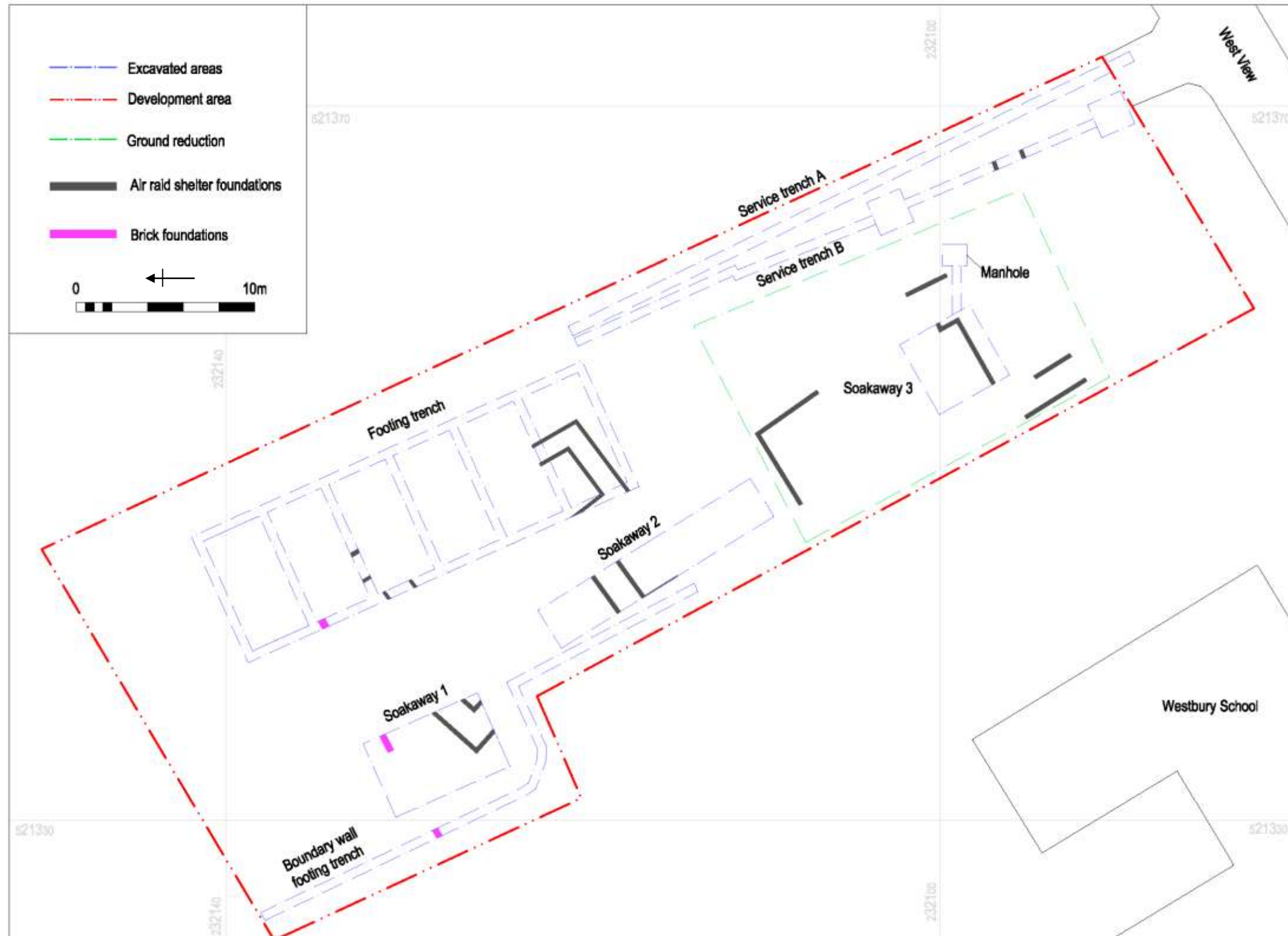
Figure 4: Excavated areas (scale 1:250)