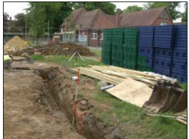
Plate 4: Boundary wall footing trench, looking south