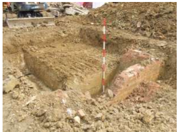
Plate 10: Soakaway 3, looking north