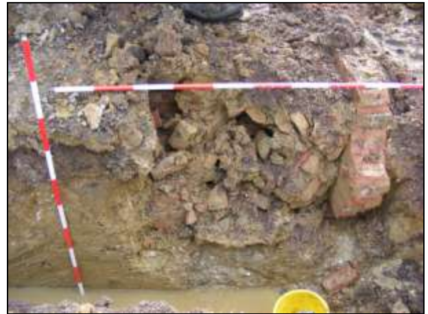
Plate 2: Air raid shelter revealed within footings trench, looking southeast