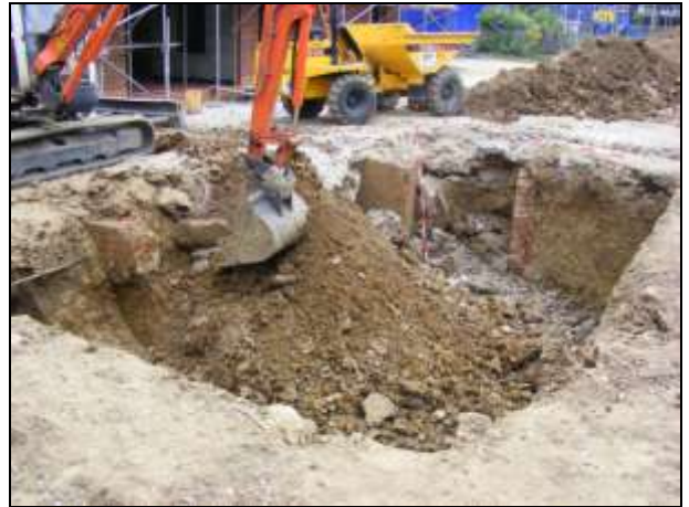
Plate 6: Soakaway 1, looking southeast