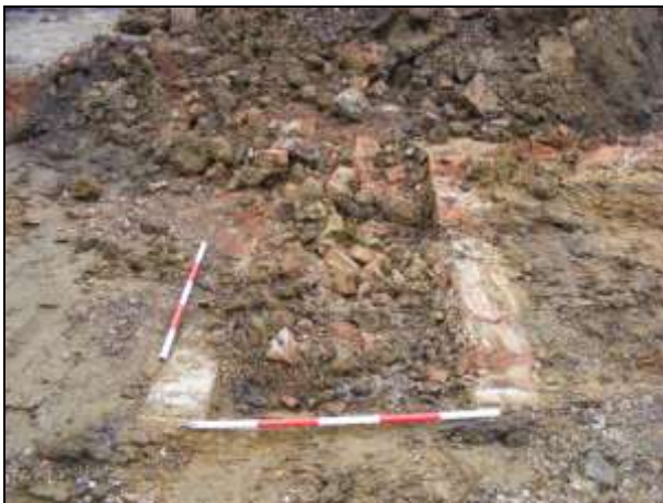
Plate 3: Air raid shelter entrance revealed in between footing trenches, looking southeast