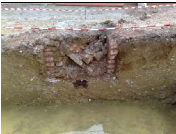
Plate 9: Air raid shelter within Soakaway 2 looking northeast