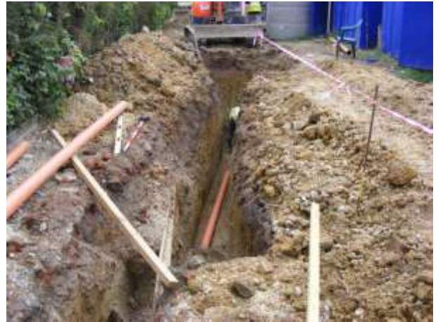
Plate 12: Service trench B, looking southeast