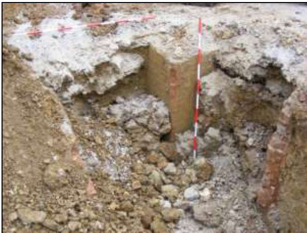
Plate 7: Air raid shelter within Soakaway 1, looking southeast