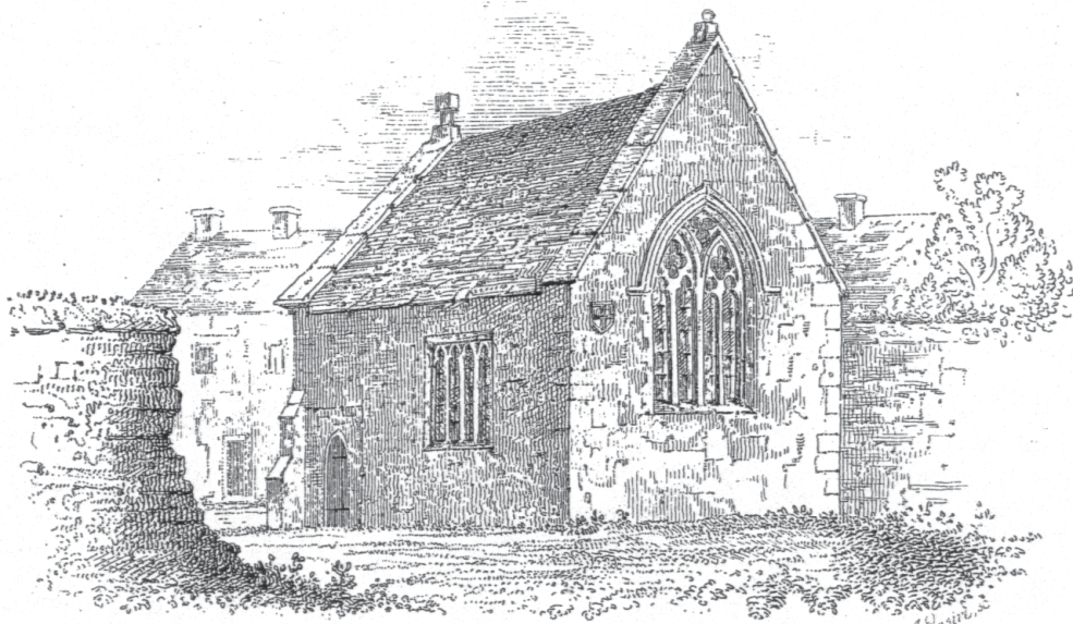
South East View.