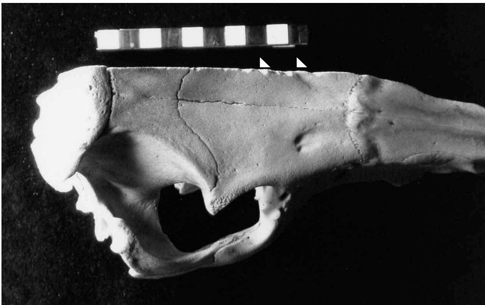
A3.10: Marks made on the cranium of pig number 2 with an iron knife and hammerstone while splitting the skull in half. Scale in cm.