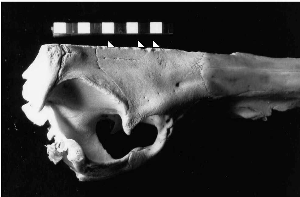
A3.8: Marks made on the skull of pig number 1 with a flint tool and hammerstone while splitting the skull in half. Scale in cm.