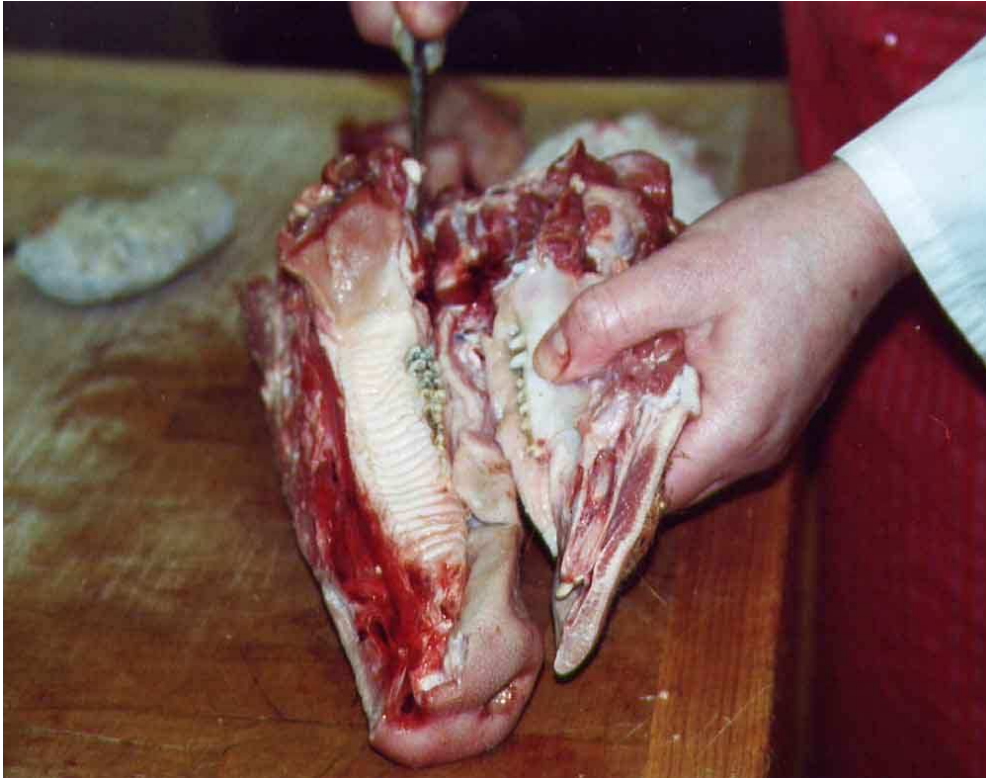
A3.7: Disarticulating the mandible from the cranium using an iron knife.