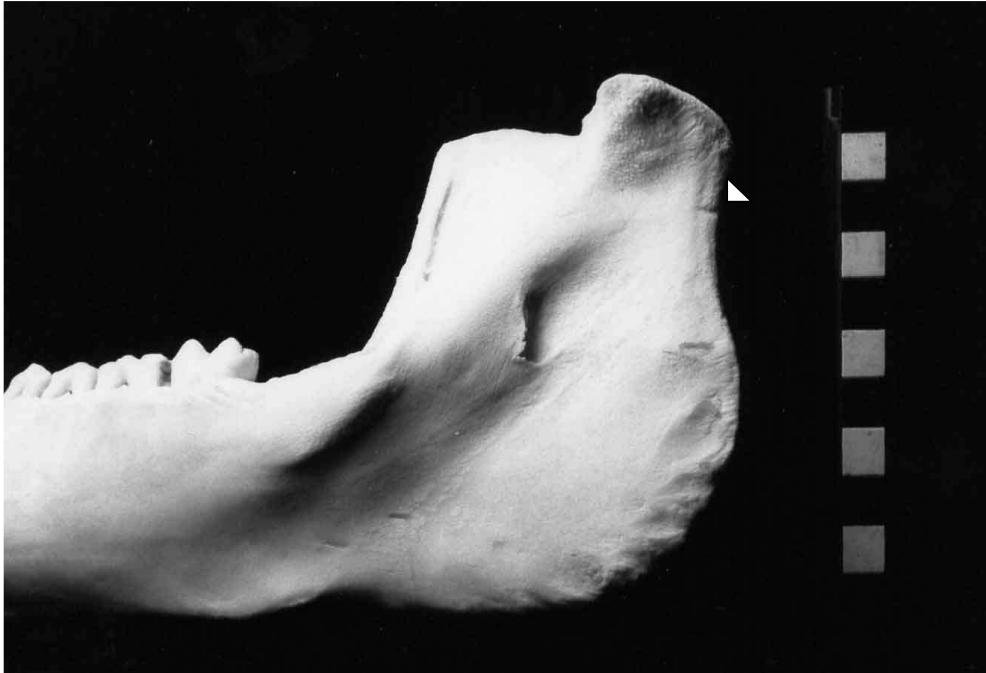
A3.9: Marks made on the mandible of pig number 1 with a flint tool during disarticulation from the cranium. Scale in cm.