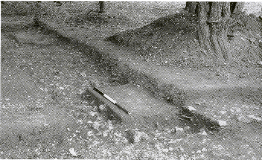
Plate V. The Iron Age trackway through the western entrance with overlying silt. On the right an island of the modern trackway