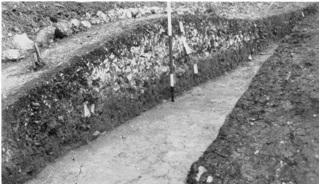
Plate II. Section of the northern bank