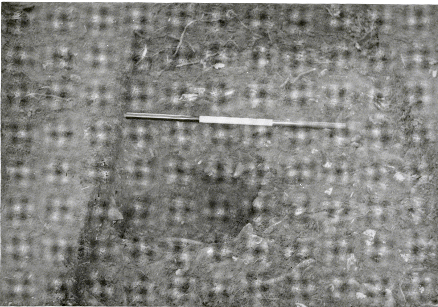
Plate VI. The fire-hole in the paved stockyard