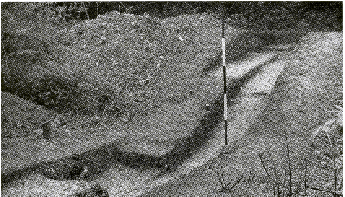
Plate IV. Section of the southern counterscarp bank and ditch