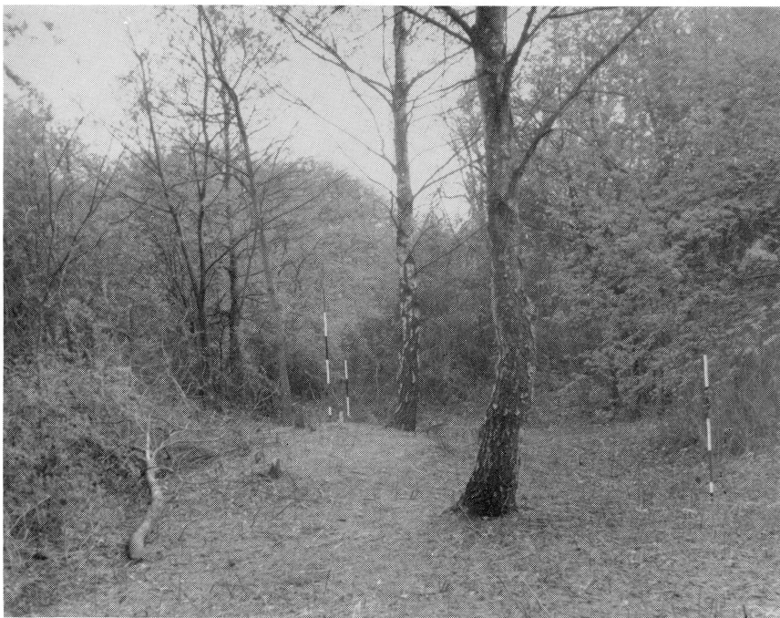
Plate I. The entrance and south-western corner before excavation