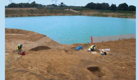
EXCAVATION IN PROGRESS