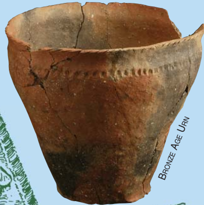
BRONZE AGE URN