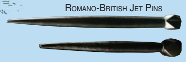
ROMANO-BRITISH JET PINS