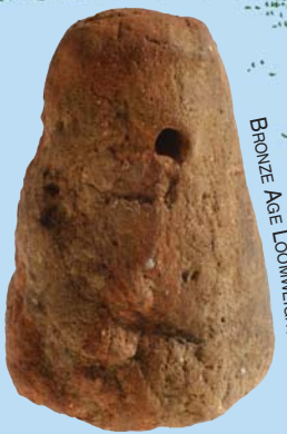
BRONZE AGE LOOMWEIGHT