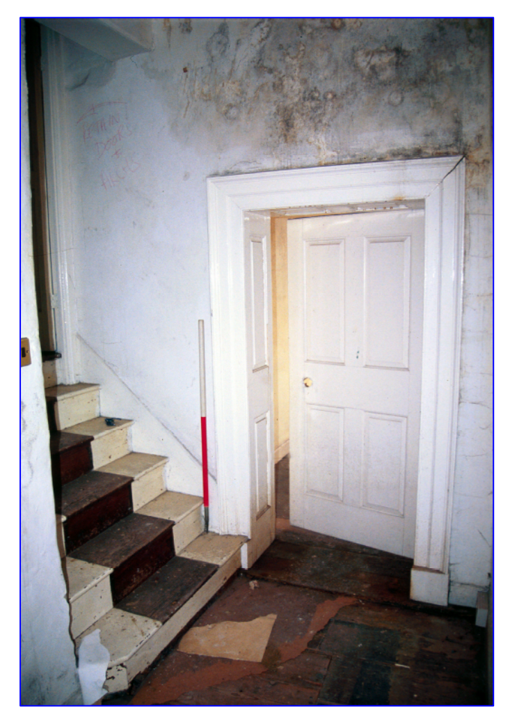
Plate 12: (074) On the first floor, rooms have doors that are four panel raised and fielded within a boxed, panelled frame with architrave. Shot depicts the door of Room 10 taken from the western half landing facing south.