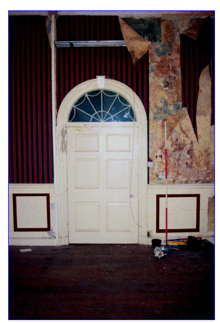
Plate 15: (036) The courtroom is accessed via a six panel door with an Adam Style fanlight header, framed by architrave with keystone detail on both sides of the door frame. This shot also demonstrates the level of water damage to the interior of the building. Looking east.