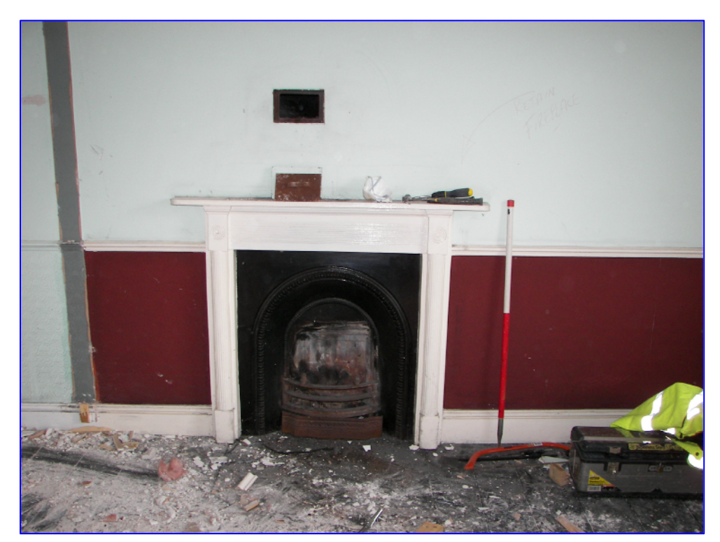
Plate 9: (shot 113) Room 16 retains a mid 19<sup>th</sup> century cast iron arched register grate that has a Regency style fire surround with concentric bosses and reeded moulding. Looking east.