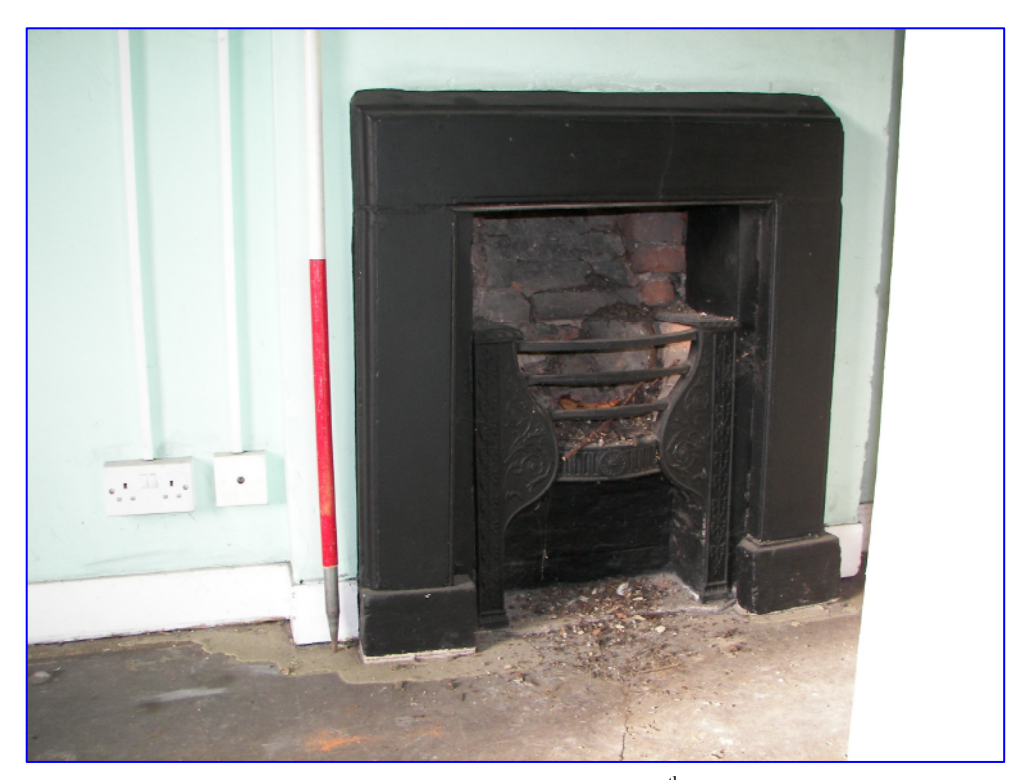
Plate 10: (123) Room 18 retains a late18th early 19<sup>th</sup> century cast iron hob grate with a plain stone surround. The same style of fireplace has been retained in rooms 19, 20 and 21.Looking north-north-west.