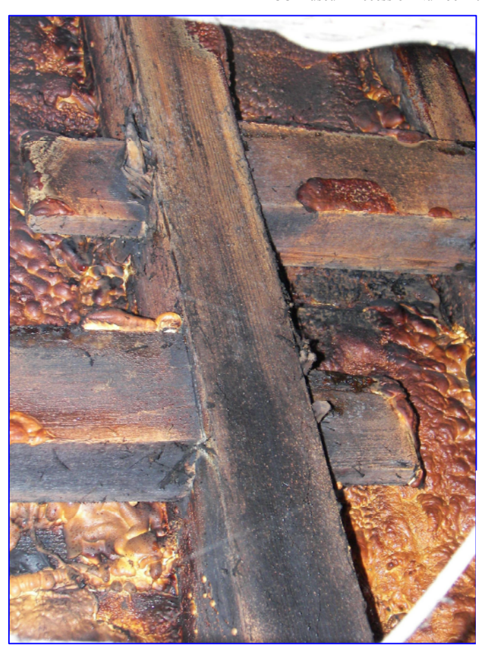
Plate 11: (shot 138) Staggered butt purlins morticed with tenons pegged behind the principal rafters and supporting common rafters. Observed in the fire damaged part of the Southern Range. Shot taken vertically.