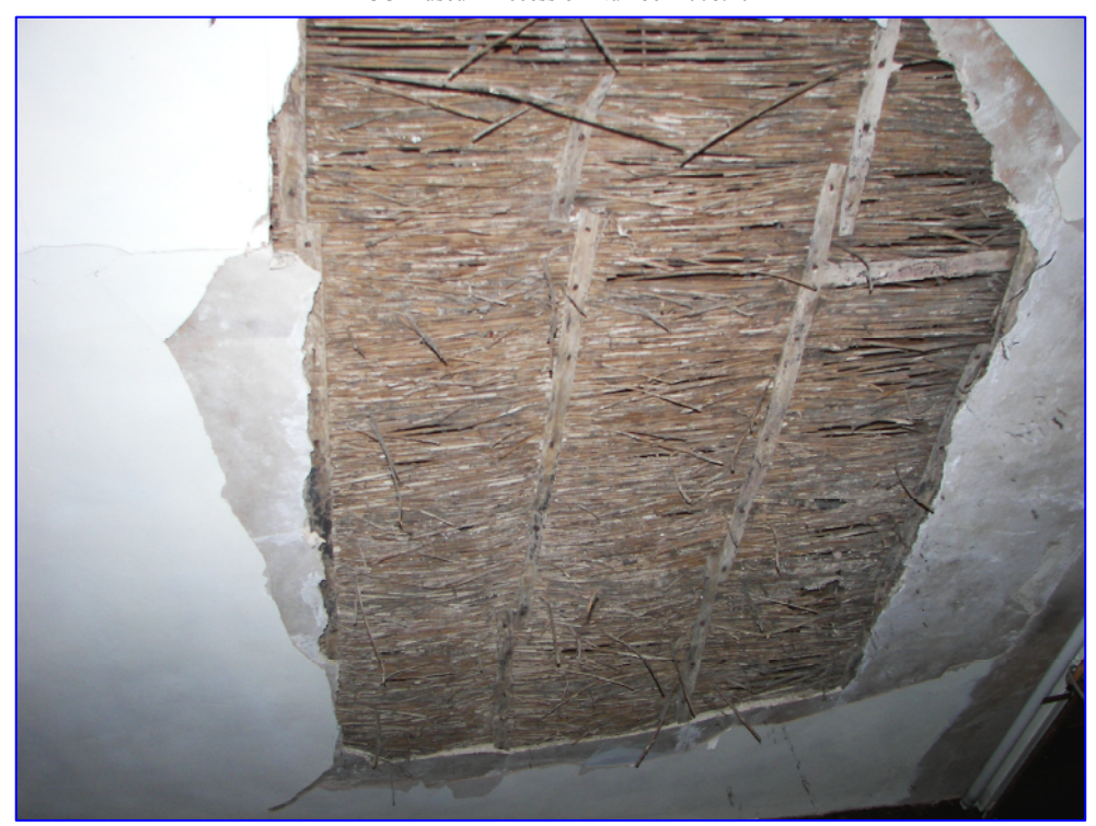
Plate 19: (057) The reeded ceiling exposed in Room 6.