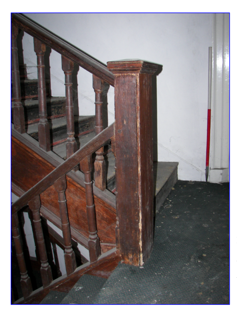
Plate 17: (167) The Western Range staircase, later 17<sup>th</sup>/early 18<sup>th</sup> century style, closed string construction with simple turned spells, heavy plain handrail and balusters. Looking north.