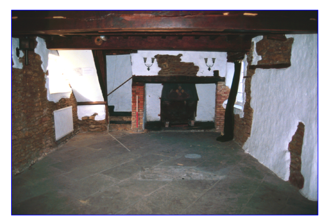
Plate 21: (047) Room 8, in the Western Range. At the northern end of the room is a broad 17<sup>th</sup> century style fireplace with a heavy timber bressumer supported on 2<sup>1/4</sup> inch brick piers. Adjacent to the fireplace is the staircase to the garret room above. Large timber cross beams support the joists for the garret floor. Looking north.