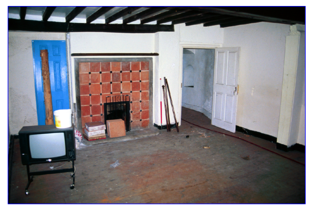
Plate 25: (041) Room 3 has a beamed ceiling with a large cross beam supporting squared timber joists, with a further beam set into the chimney breast crossing a recess on its eastern side. There is a tile backed modern retro fireplace incorporating iron studs and a small grate fitted to the chimney breast on the south wall. The floorboards are also a relatively recent addition to the building and the internal doors are modern replacements. Looking south-east.