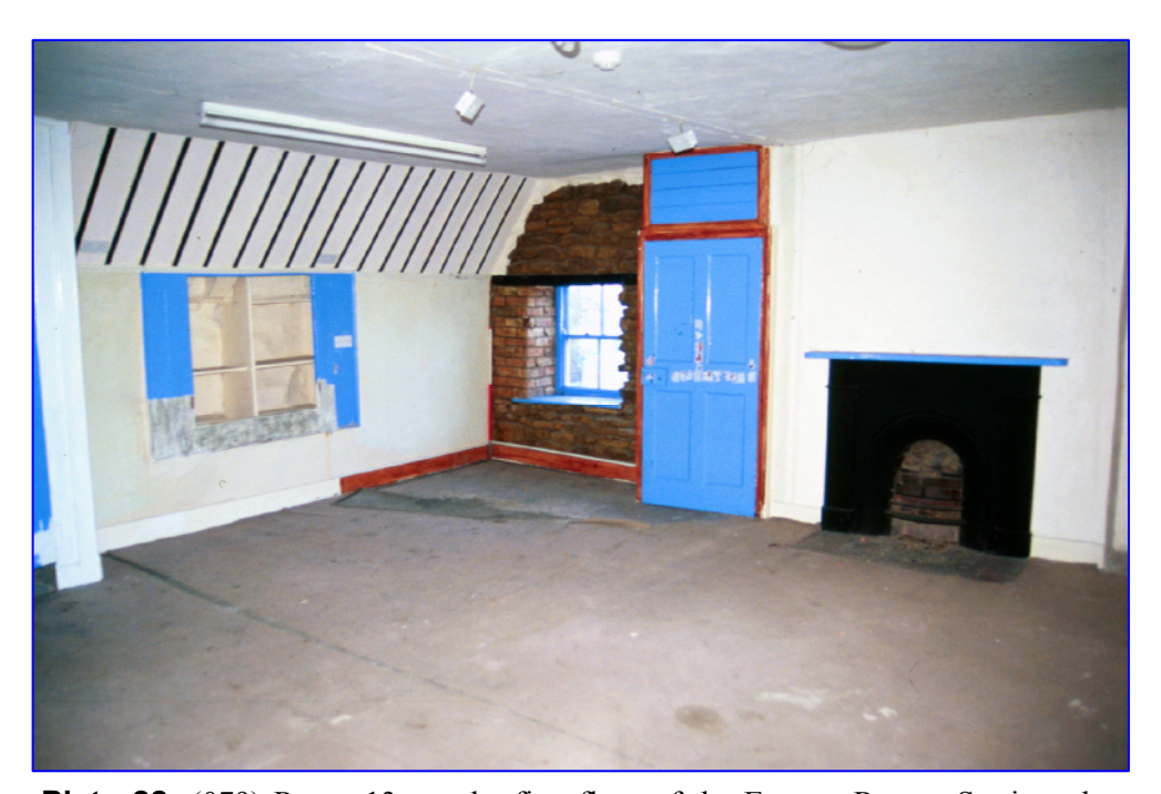
Plate 22: (079) Room 13, on the first floor of the Eastern Range. Set into the chimney breast on the northern wall is a 19<sup>th</sup> century cast iron arched bath grate with a plain stone mantel and pillars. The door leads to Room 14 down a short flight of stairs. Looking north-west.