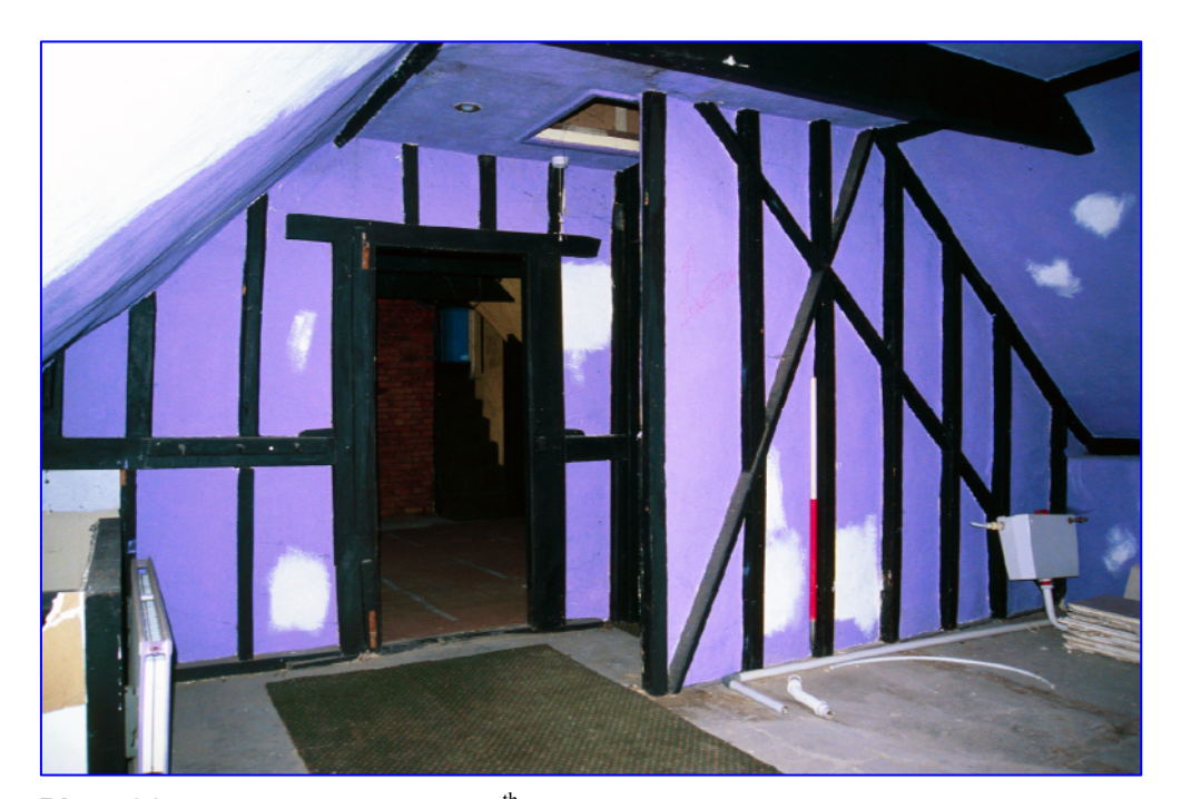
Plate 26: (085) Room 15. The 18<sup>th</sup> century type doorframe in the southern wall of this room is constructed in heavy timbers that form part of the roof superstructure. It has an expanded lintel that is secured to the jambs with pegged mortice and tenon joints supporting timber studding to the apex of the roof. An original latch hoop is still attached to the north side of the frame. A partition wall of timber uprights with cross bracing may have enclosed what may have been the original internal staircase access. Looking south-east.