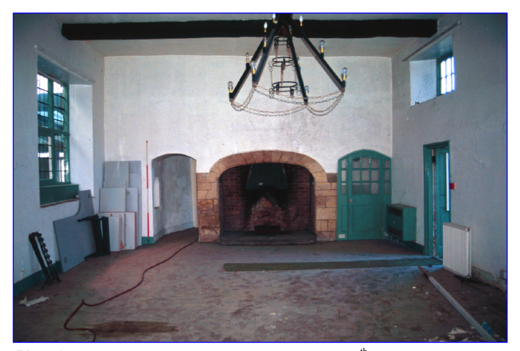
Plate 24: (038) Room 2. In the north wall is a large 18<sup>th</sup> century basket arched fireplace with integral moulded stone surround and buttresses over an integral stone slab. There is an arched recess to the east of the fireplace with a half glazed nine pane door flanked by narrow three light sashes. The arch to the west passes through a former oven set into the corner of the building with an external curved wall. Looking north.