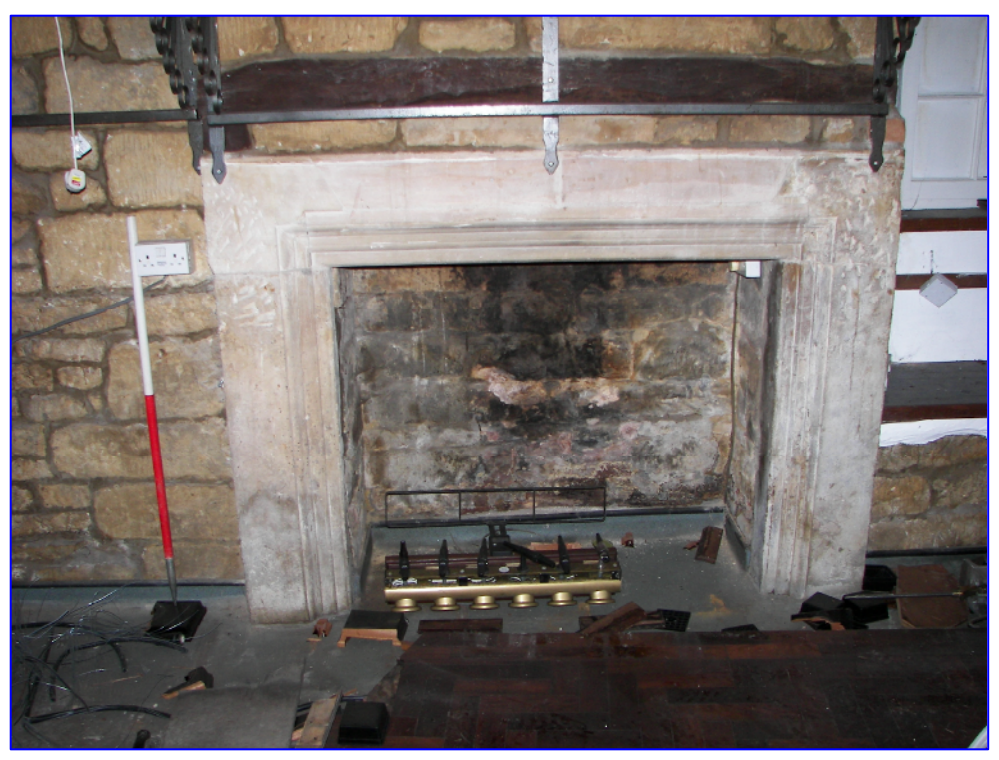
Plate 18: (056) Room 6 in the Western Range, 17<sup>th</sup> century open fireplace with a stone surround. Looking west.