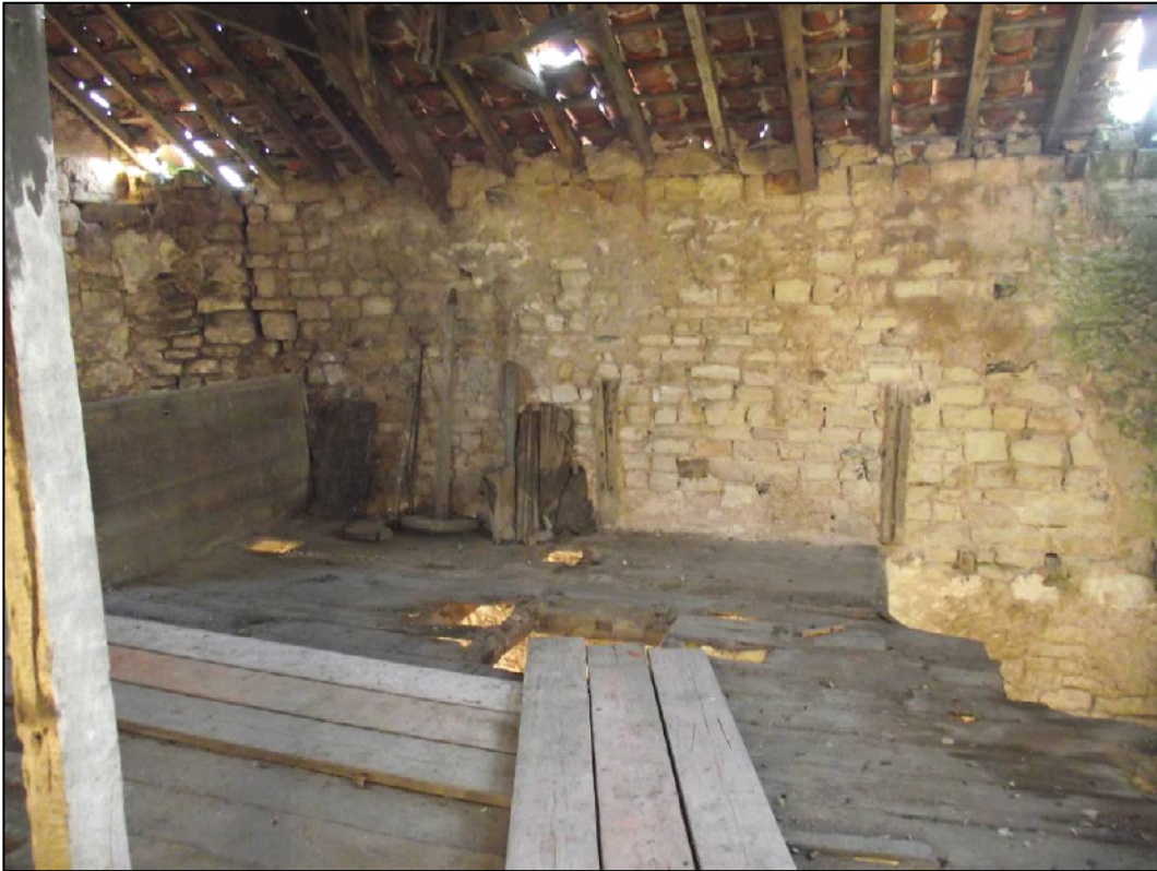
Plate 35 (Shot 64): Second floor, looking south-south-east showing tools and fittings against south wall and voids in the floor