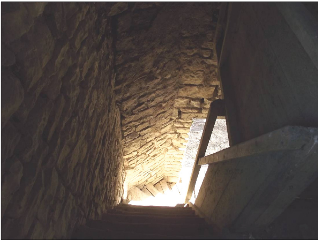
Plate 34 (Shot 67): General shot looking down the staircase to first floor. Looking south. Note internal buttressing in the angle of the two walls