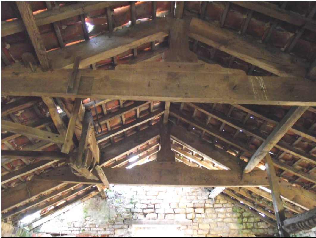
Plate 31 (Shot 58): General shot of roof structure, also showing pulley to the left. Looking west