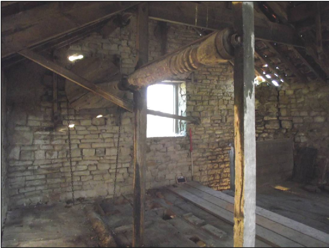
Plate 33 (Shot 54): General shot of sack hoist machinery and staircase in the south-east corner leading down to first floor. Looking east-south-east