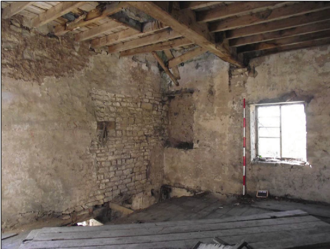
Plate 29 (Shot 57): General shot of first floor south and west elevations, showing holes in the floor, the recess in the west elevation and exposed limestone walls where the plaster has fallen off. Looking south-west