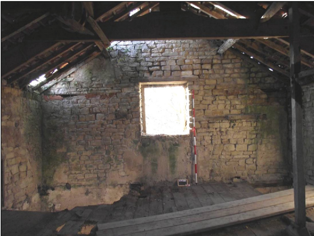
Plate 36 (Shot 66): General shot of west elevation on second floor. Looking west