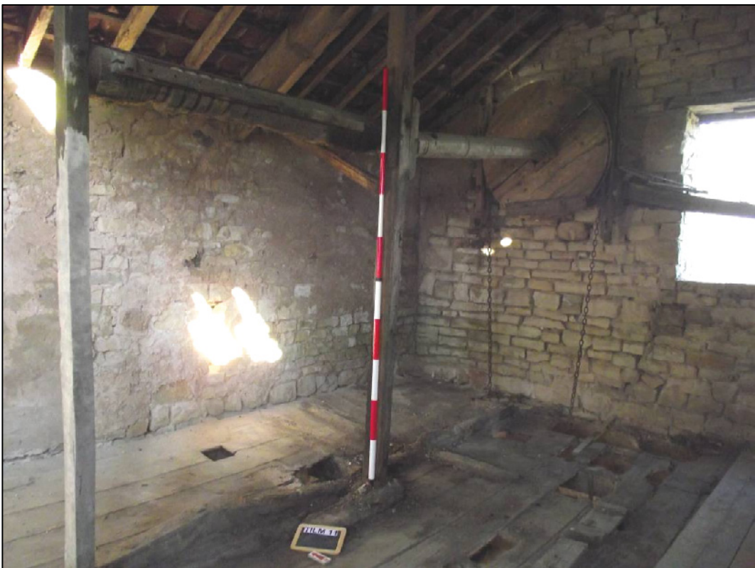
Plate 32 (Shot 62): General shot of sack hoist machinery on second floor. Looking north-east