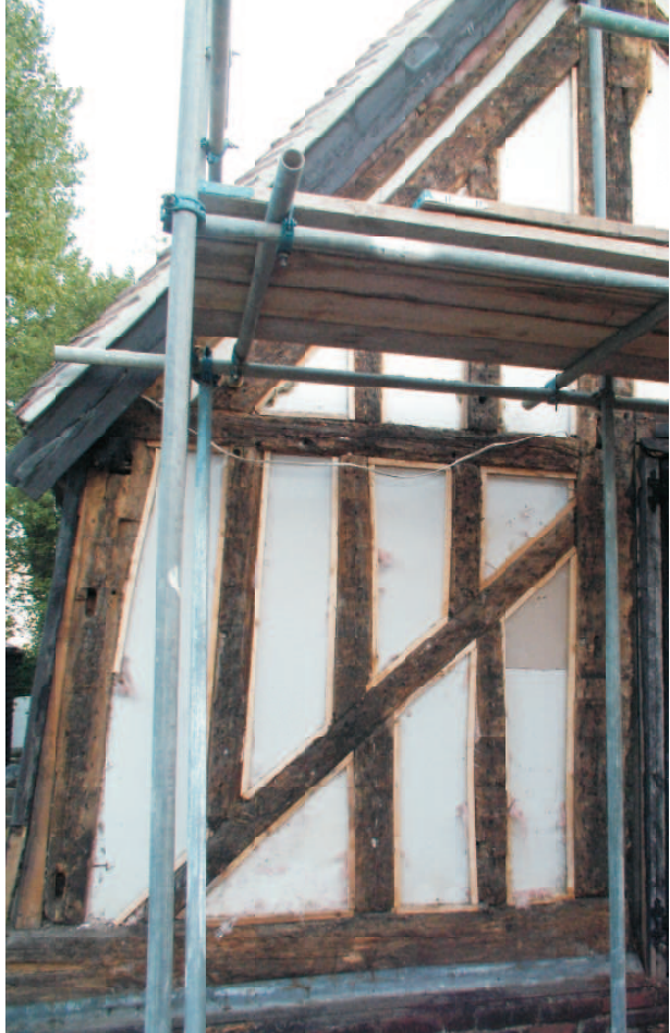
09 shows the truss design in more detail. The arcade post, aisle tie and aisle corner post are stiffened by the inner principle or shore. Structurally the lower primary brace for the infill should not be needed. But this is possibly a rebuilt end.