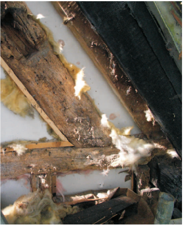
52 shows detail at aisle tie at the northern end.