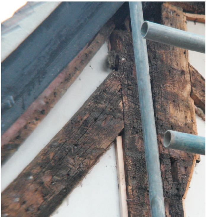
10 shows top of arcade post detail.