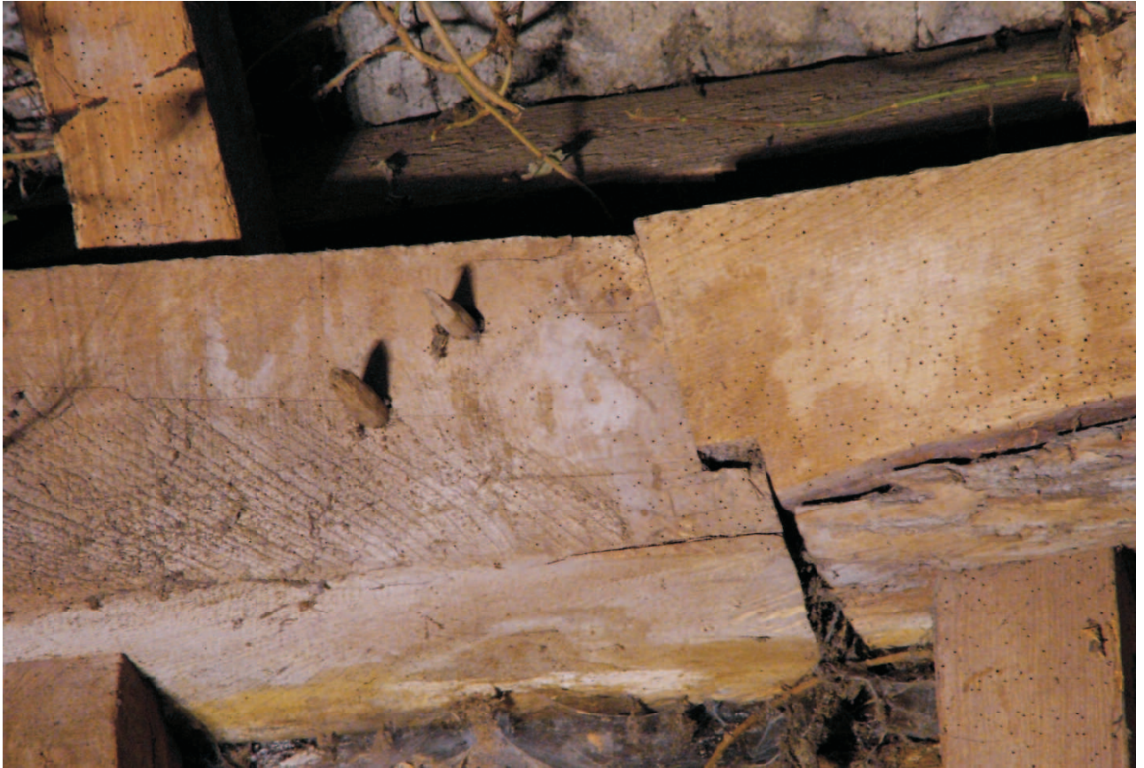
The one visible original scarf joint on the rear wallplate. Housed bridled undersquinted abutments with lower lip and two edge pegs. This is a type very commonly found in groundsill plates from the medieval period onwards but rarely as a wallplate scarf.