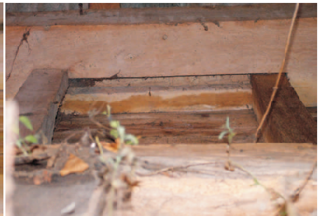
Wall studs fitted above the midrails were fitted in pairs. One end was mortised into the rail - in this example the midrail and the area between the two studs was cut out as a long mortise. This enabled the studs to be placed into the frame after the main frame was assembled. Note the auger marks to sides of mortise.