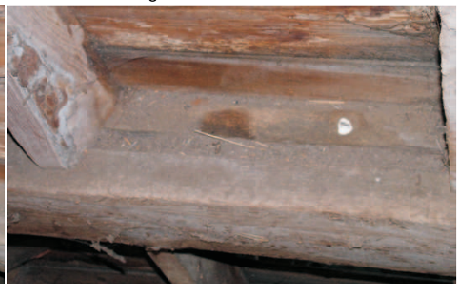
Most examples in the barn have the long mortise as the lower element. They have filled over the years and are not easily visible within the structure unless viewed from a high level.