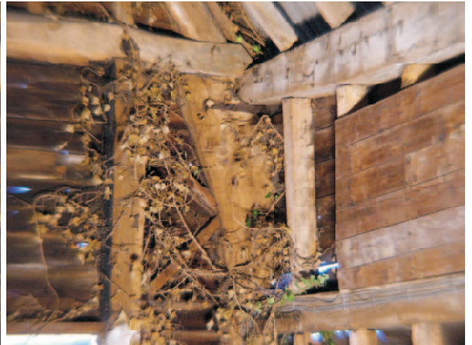
Heavily jowled tops to main posts of midstrey doorway with paired large holes for hanging original doors. Inserted posts bolted through tiebeam are for C20 opening lower and narrower doors.