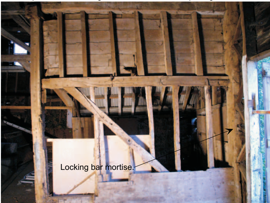
Locking bar mortise.