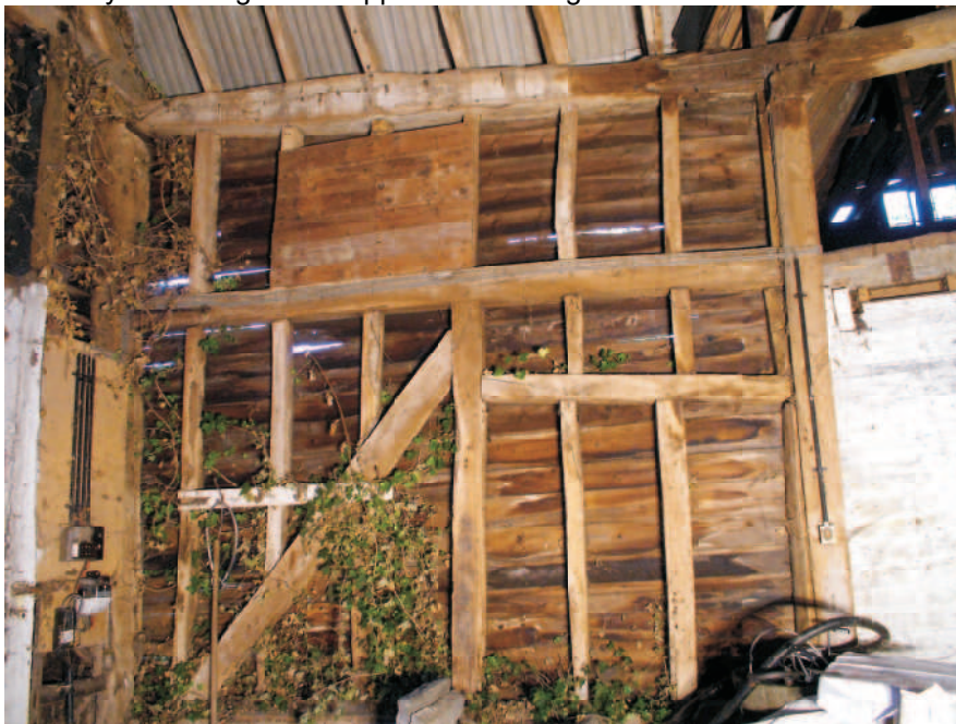
Walling to west side of midstrey is to same pattern as main body of barn. Heavy section long primary brace, no midrail but door head rail.