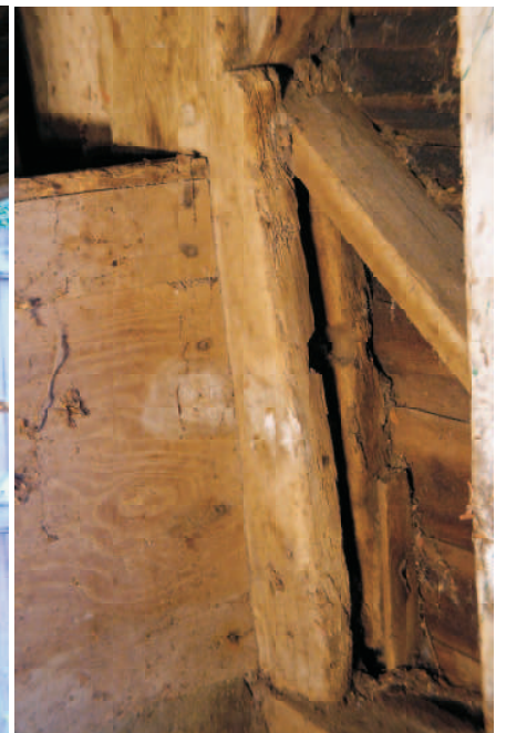
Eastern side frame to midstrey with different bracing pattern and inserted doorway. Boarding above appears to be original. Board slots at base.