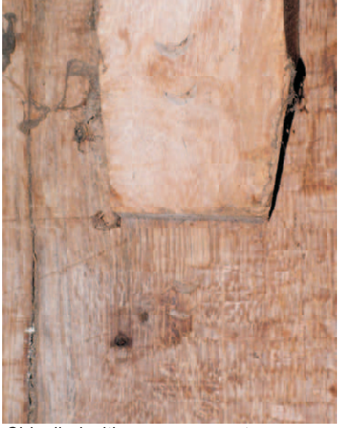
Chiselled with gouge carpenters assy. marks to arch braces and storey posts.