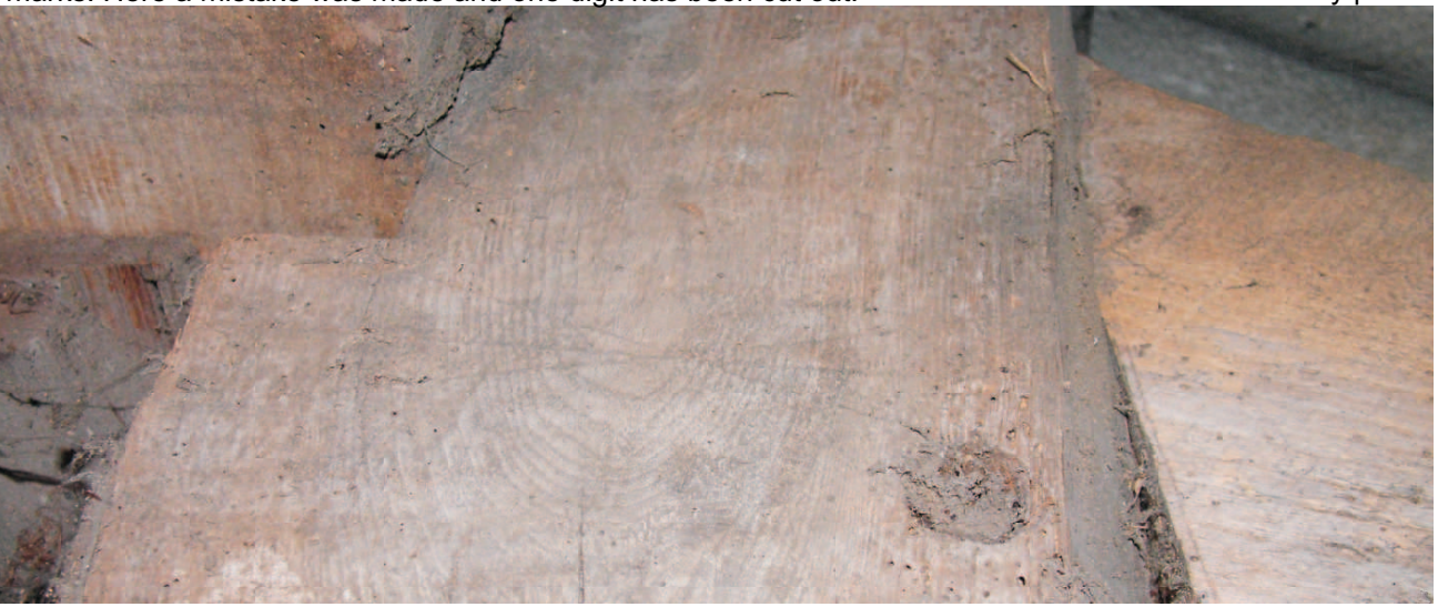
Example of face mark to one of the tiebeams. This shows the fair face produced from hewing the timber and is used as the set-out face when marking out the frame. Were visible on some tiebeams and principle rafters.