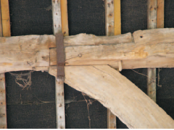
(297) Fifteenth century scarf joint