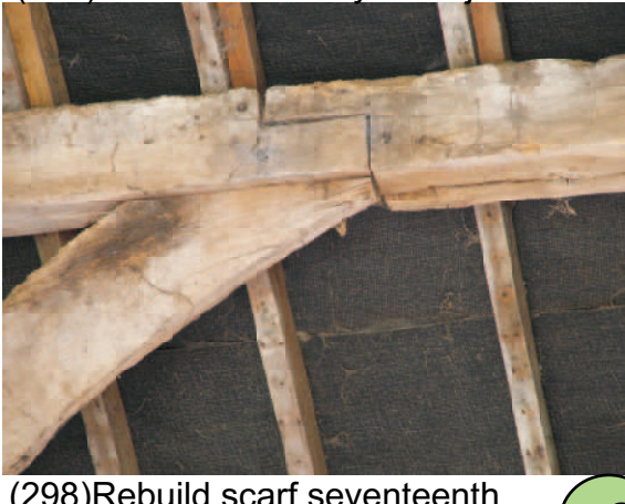
(298)Rebuild scarf seventeenth century.