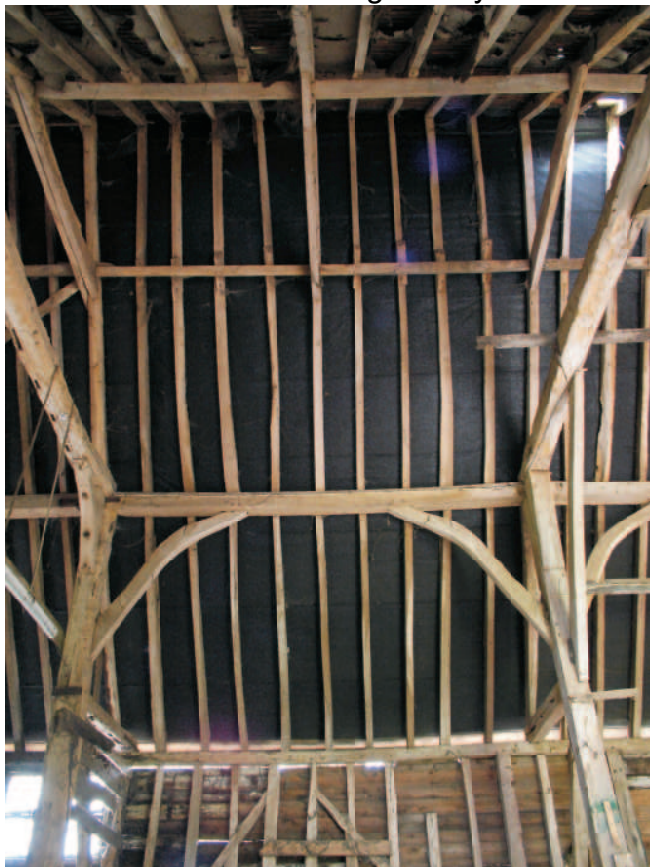
(266) Roof form in eighteenth century bay 6-7 east with simple clasped purlin roof