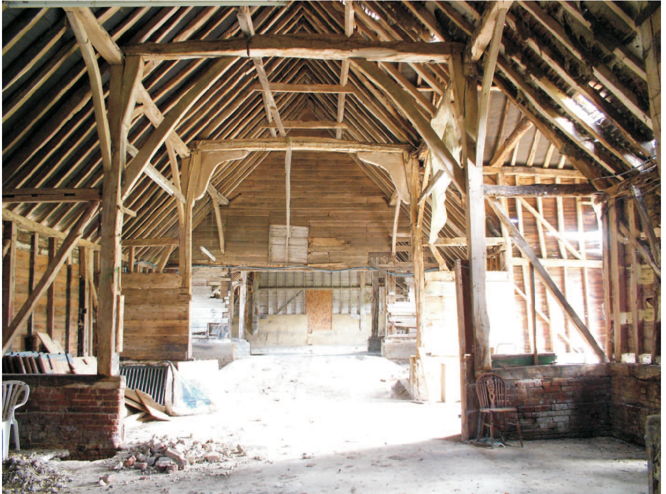
(277) Long view from south in bay 7-8 to infill on trusses 4 end of seventeenth century rebuild and truss 2 closing off bay 1-2