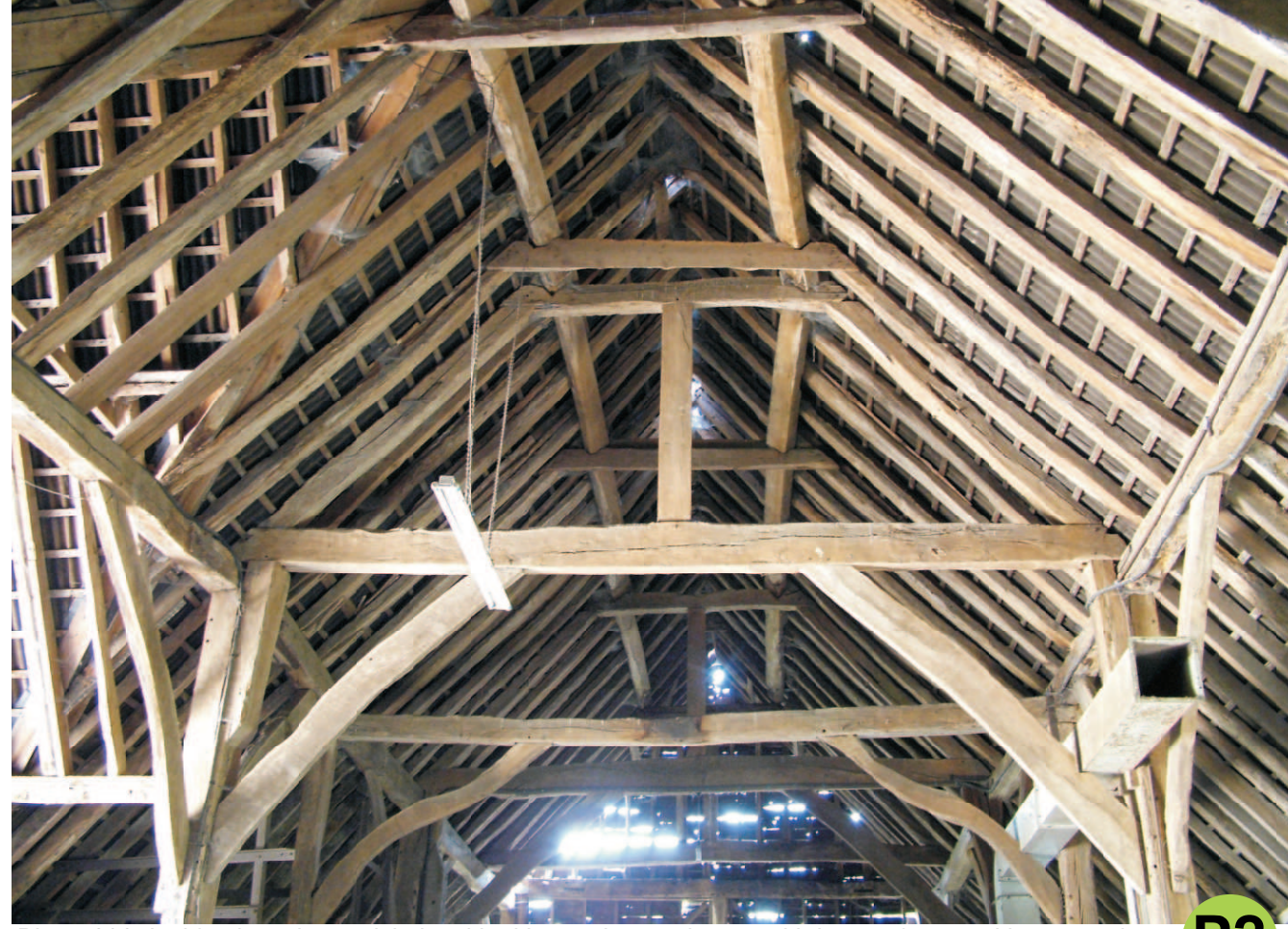
Photo 208. Inside view above aisle level looking to the south east with heavy duty trunking on arch braces, crown strut from tiebeam to collar with extra part truss with serpentine bracing at mid bay.