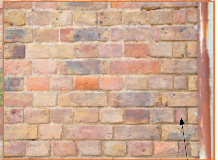
Large photo 136. Typical outside of stable block with good stock bricks.