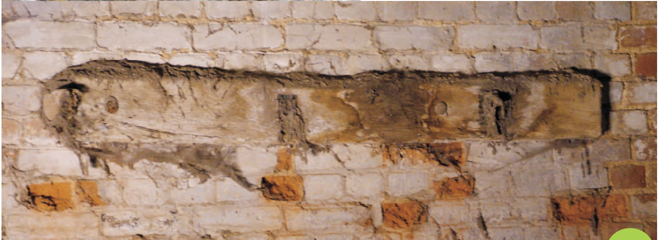
Photo 142. Inside wall showing remains of harness rack.