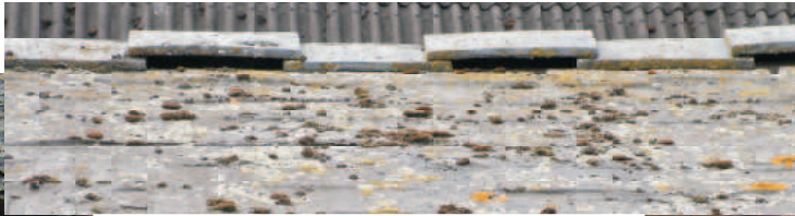
Photo 192. Ventilated ridge to slated roof.