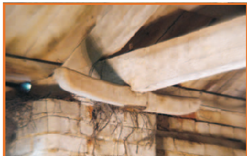
Photo 154. Harness rack fitted under tiebeam. Were fitted to both sides of the opening