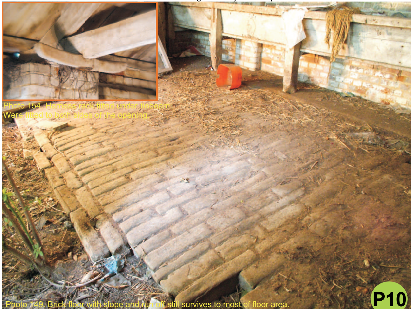
Photo 149. Brick floor with slope and run off still survives to most of floor area.