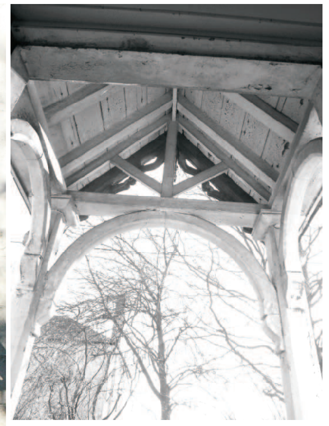
Inside view of porch showing king post supporting the ridge board and rafters down to plate.