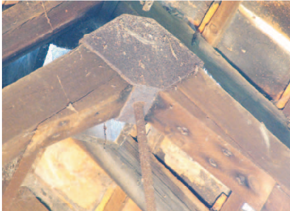
Top of truss casting with tension anchor