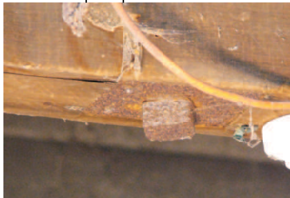
Tension bar locking bolt & plate