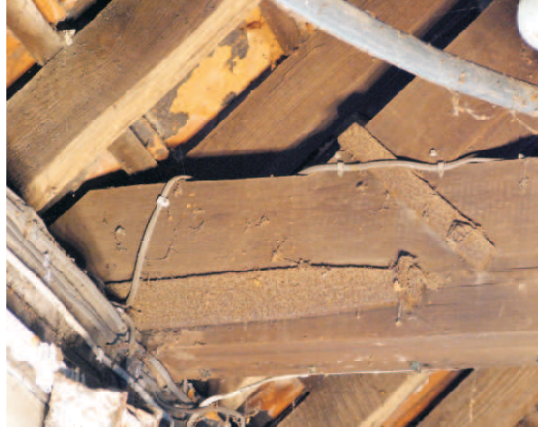
Tiebeam & principal rafter iron ties