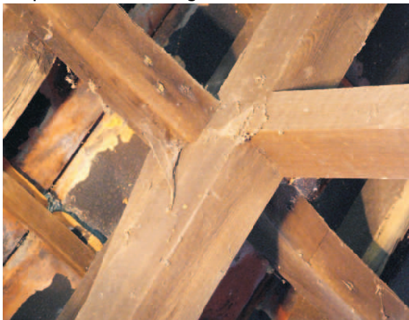
Principal rafter & purlin with location blocks