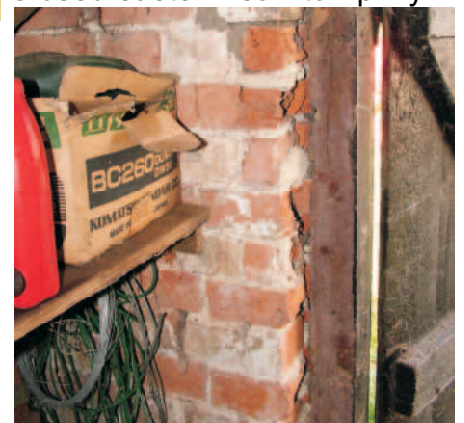
Section of door opening to eastern lean-to showing bricks cut back to enlarge opening