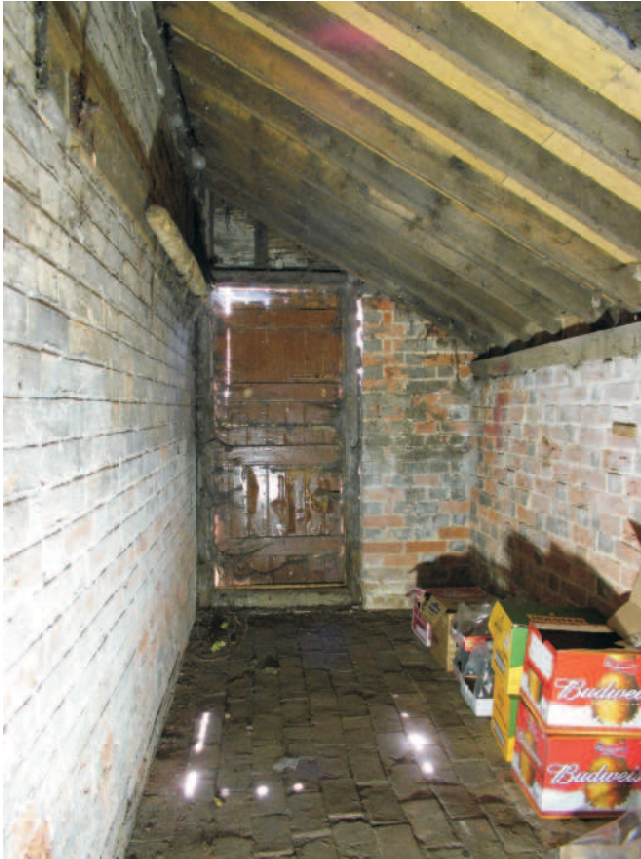
Lean-to looking into west area. top left the anchor board for the tying hooks in front area.