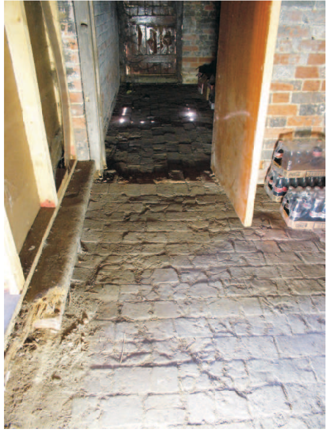
Lean-to central area with wood floor from front area finishing as a step