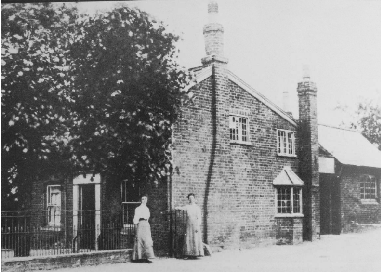
Earliest photo. Hop Poles about 1900 with brick walls and original roof line