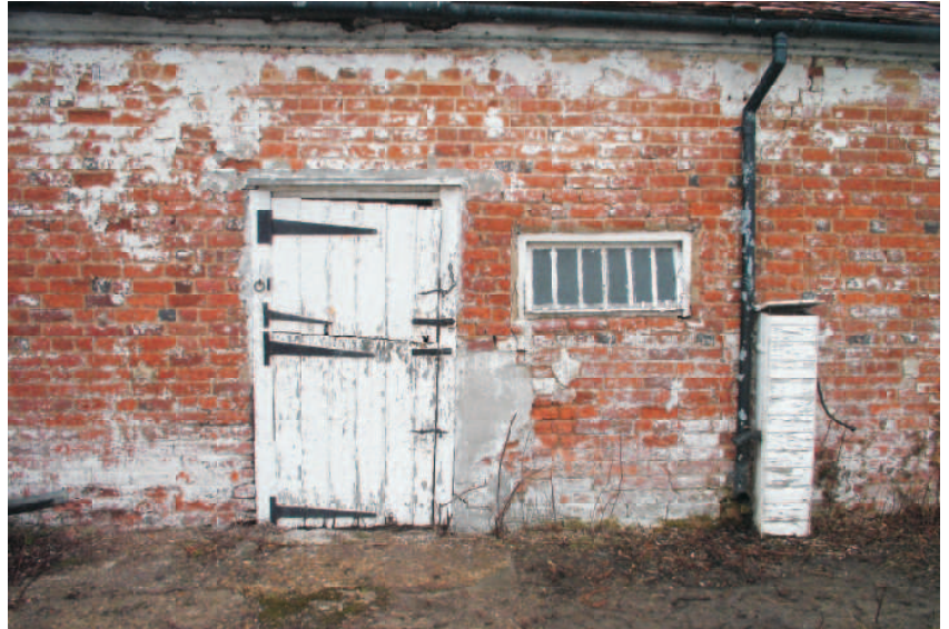
Entrance to carriage shed that also has wide inner door to nag stable. Pivoting timber window and boxed water pump.