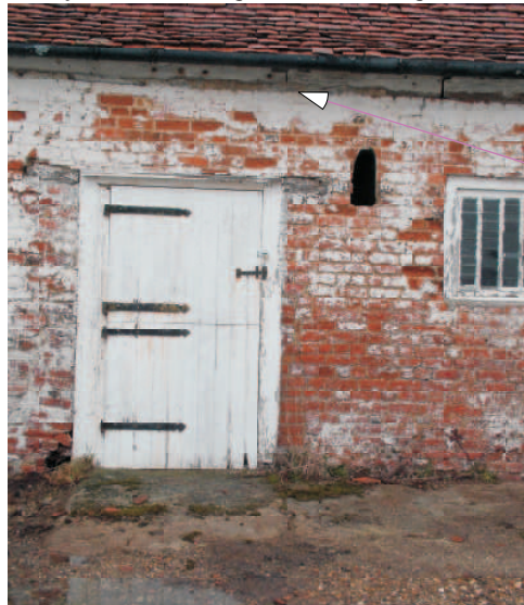
Entrance doorway to carthorse stable with brick vent to east.