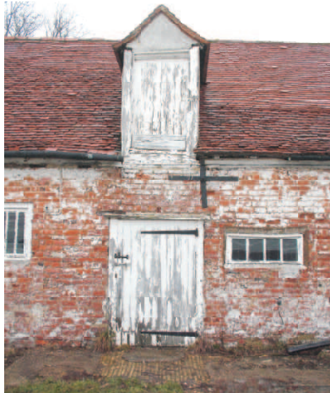
Nag Stable doorway with Hay Loft above and yellow flooring bricks on edge to entrance.