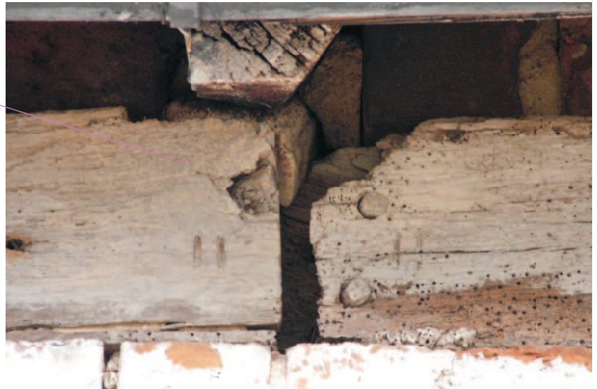
Bridled scarf to south wallplate above stable door with chiselled carpenters marks II. Suggests building may have extended to west.