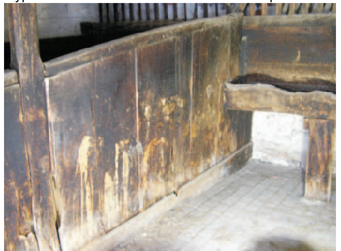
Wide board infill to stall divisions.