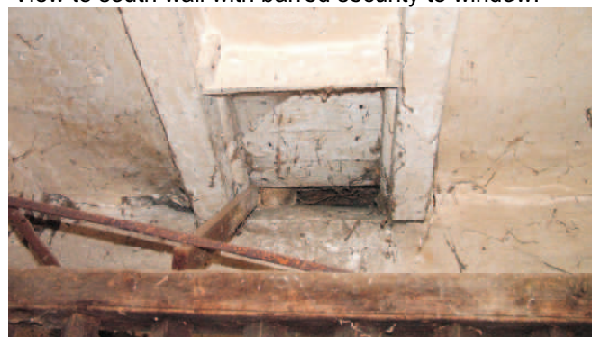
Hay feed trap (1of3) with cover from the loft above.