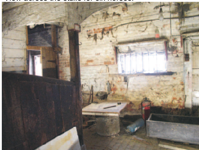
View to south wall with barred security to window.