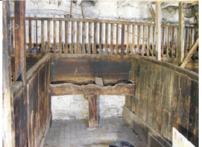
Typical stall for two horses & brick floor of square sets.