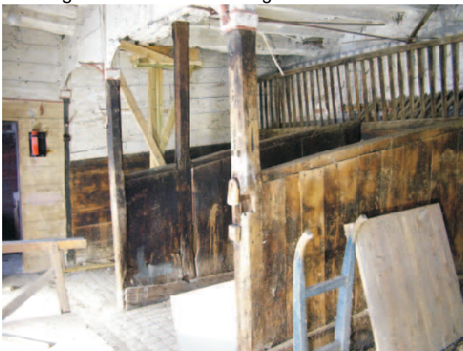
View across the stalls for six horses.