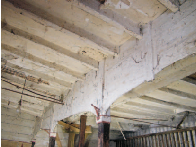
Building B. Pelmet fronts to Nag stable stalls.