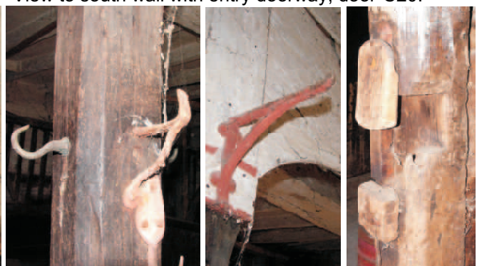
Some hooks on posts. Lamp hook. Locking bar.