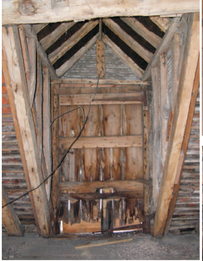
Gabled roofed timber framed dormered loading door to the farmyard. Good wide boarded unbraced door suggests eighteenth century as do the long fine hinges.