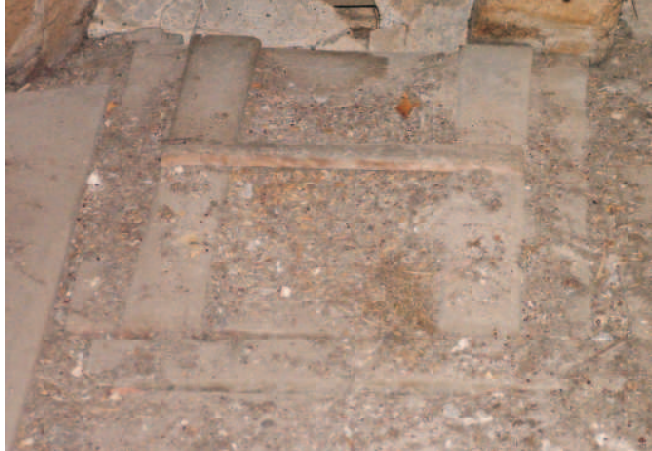
Cover to hay drop hatch (1 of 3) to hay racks below.