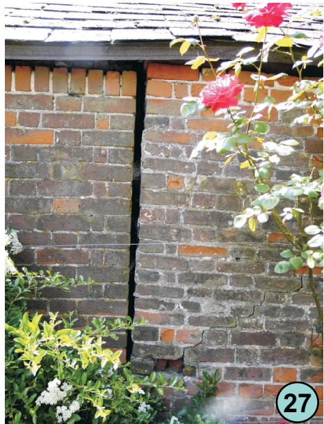
Same wall from the north showing later brickwork to the right.