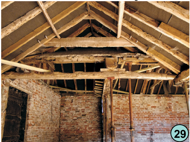
View to north showing how west range linked to north.