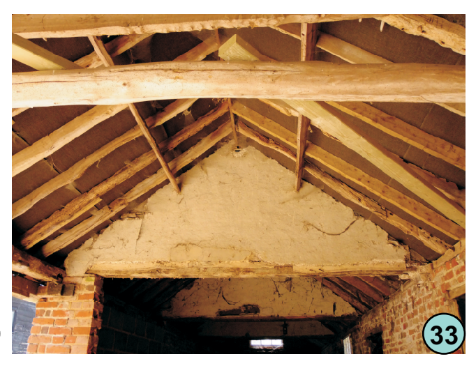
Typical area of roof structure with re-cut reused timber and all reworked in twentieth century. Was closed brick end wall under gable against start of open area to the north.