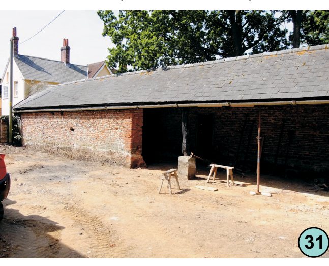
Mid C19 shelter and storage sheds to the west of the yard. Good northern quoined brick pillar to sheds but infill wall uncoursed flint and random brickwork.