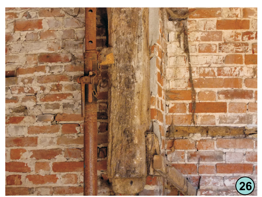
Junction of walls to the north showing later build on the left tending to fall away.

North open range view into north-west corner. Shows cut return of what was original end to this building with timber frame infill. Plastered gable to the west. Beyond this point brickwork changes and is part of the western north-south range. Door in west wall appears to be C18 so could have been moved from the end wall of the north range. This corner a closed room after C19 build.