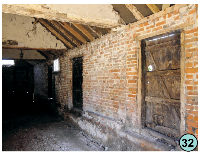
View to south in C19 shelter/storage sheds with minimal partitions removed but plastered area of gables left in place. Both windows are late insertions. Brickwork only fair faced to outside west.