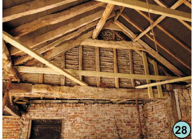
View to west showing end truss of north range.