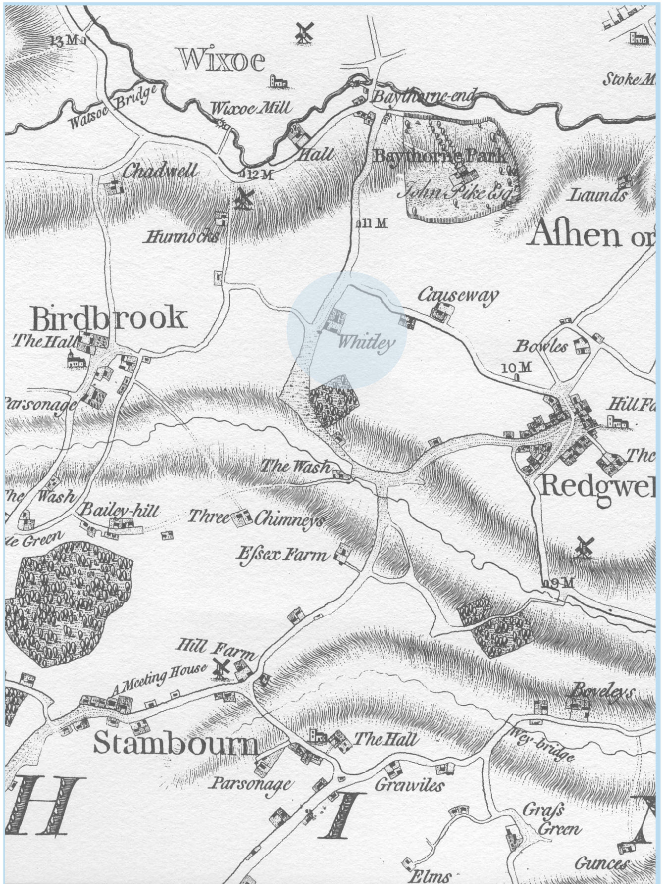
Extract from the Chapman & Andree map of Essex from 1777.