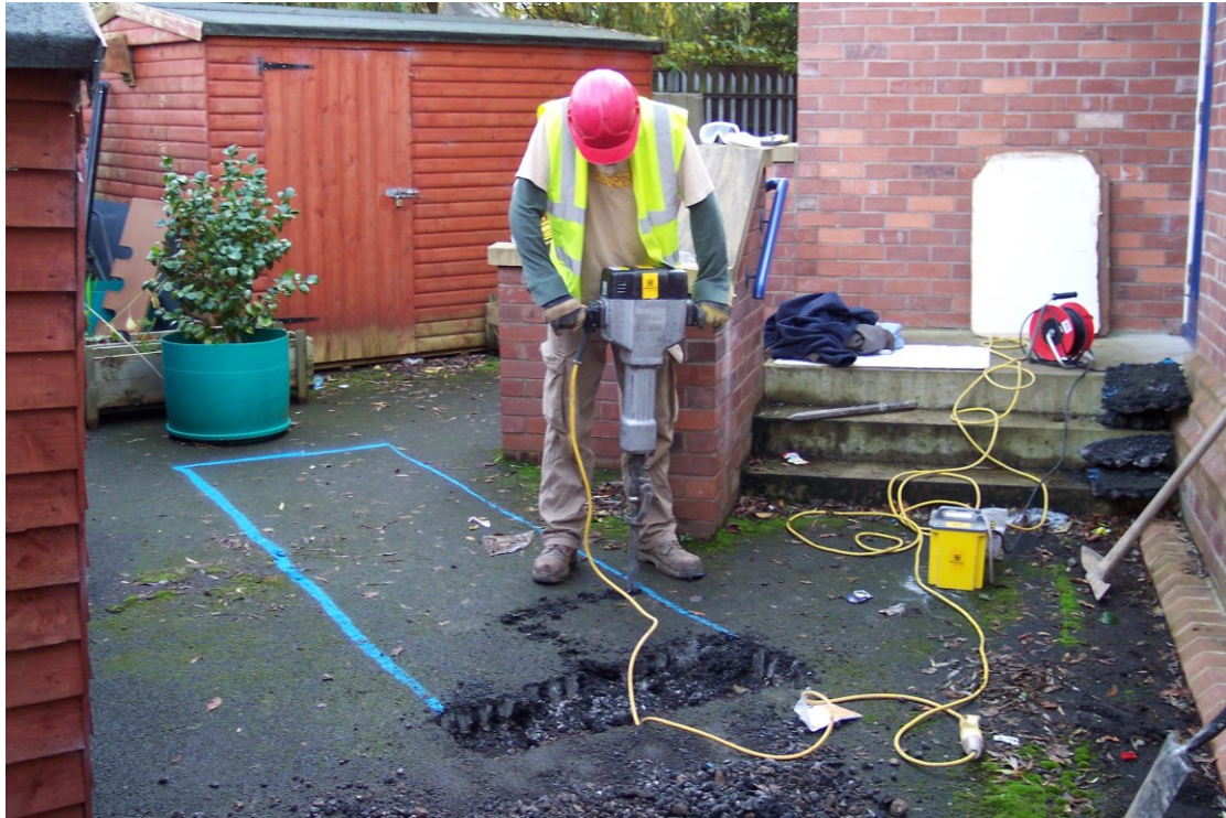
Plate 1: Removing the tarmac and concrete, 01 , with a breaker