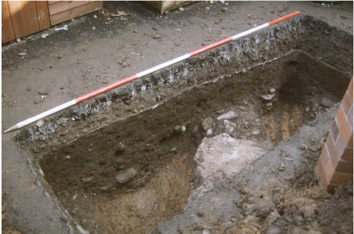
Plate 7: South-facing section of trench, facing north-east