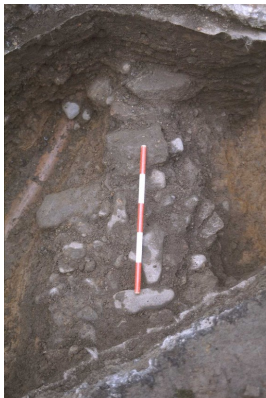
Plate 6: Detail of cobble surface, 06 , facing south