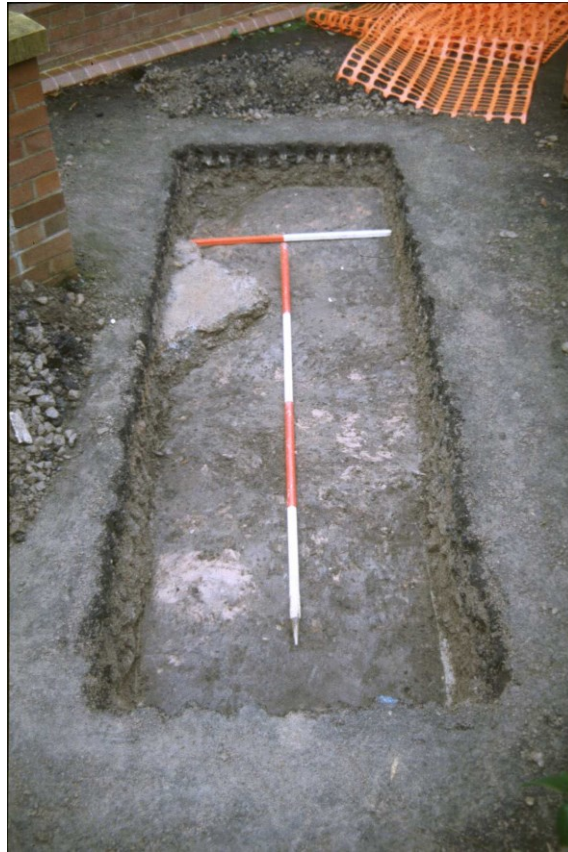
Plate 3: School construction levels, 04 , uncovered on removal of terram, 03 , facing west