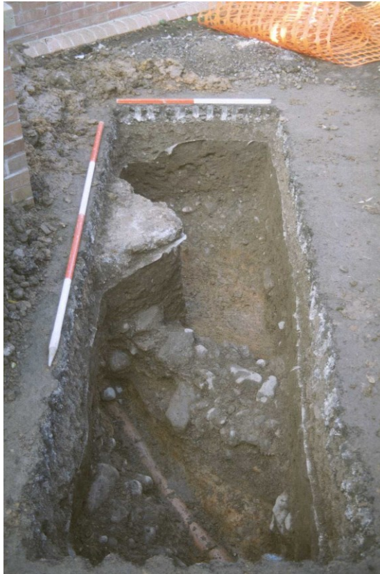
Plate 5: Cobble surface 06 on excavation of ditch, 09 , and pipe trench, 07 , facing west