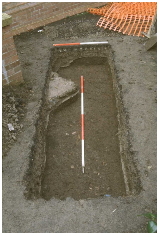
Plate 4: Garden soils, 05 , on removal of school construction levels, 04 , facing west