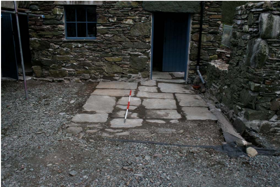
Plate 9: External flagged floor (10)