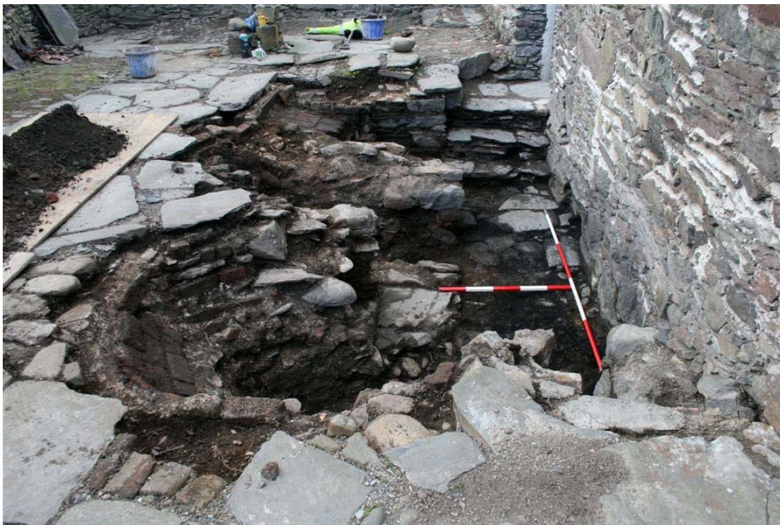
Plate 3: General view of the excavated area illustrating the series of sunken hearths