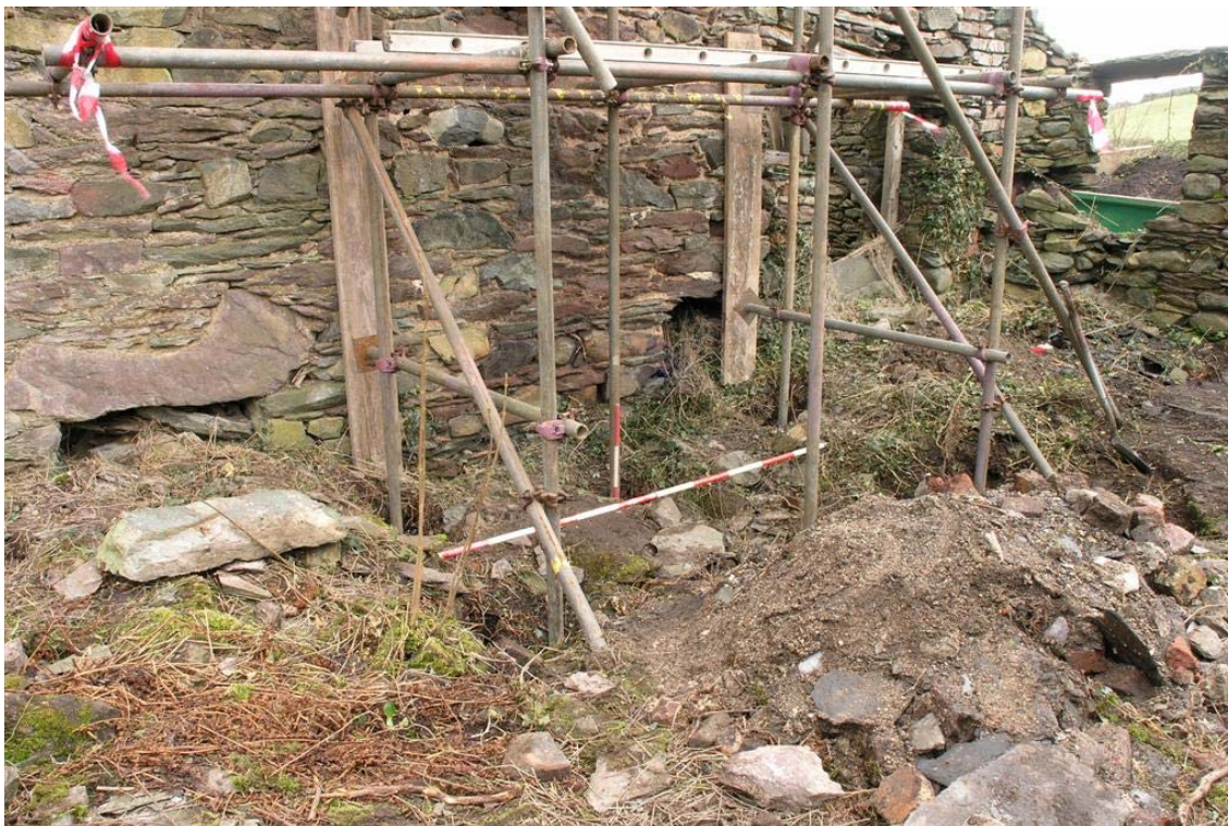
Plate 1: Area below scaffolding in Room 7 prior to excavation in 2007