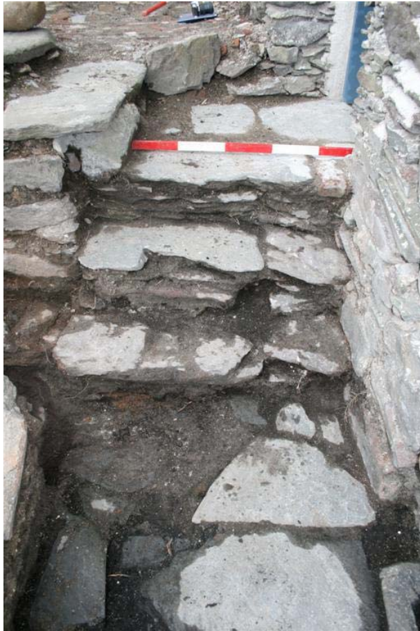
Plate 7: Stone steps (05) providing access to the hearths