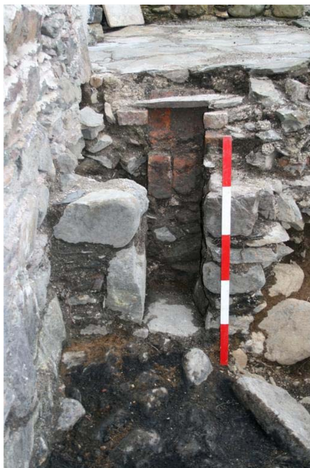
Plate 4: The easternmost of the hearths (01)