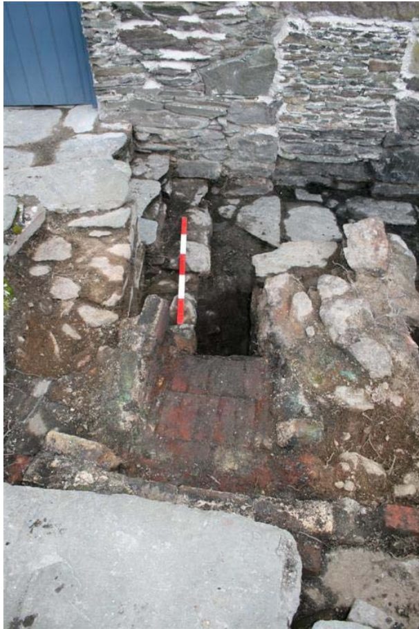
Plate 6: Hearth (04)