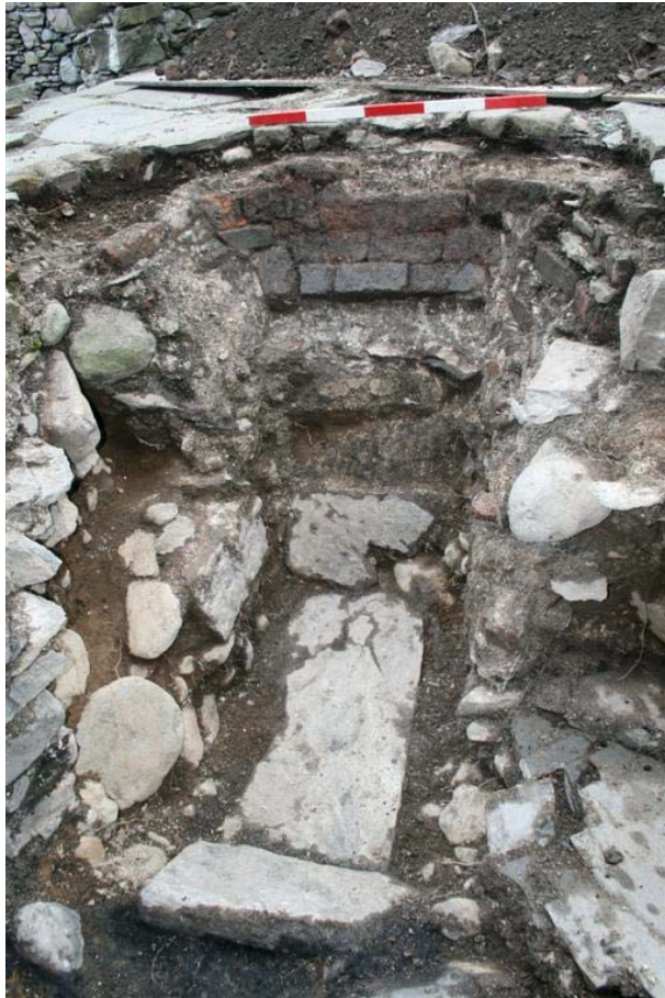
Plate 5: Hearth (02)