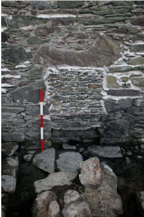
Plate 8: Blocked hearth (09) in the north wall of Room 7