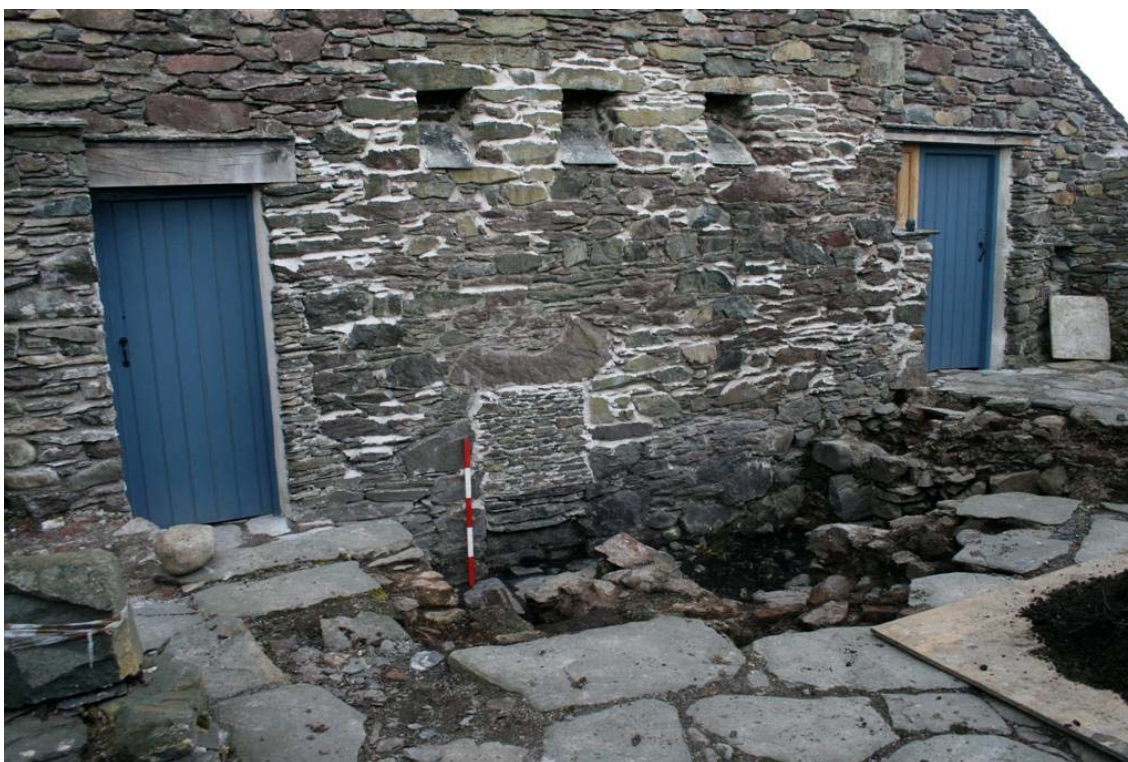
Plate 2: Area below scaffolding in Room 7 following removal of scaffolding and excavation