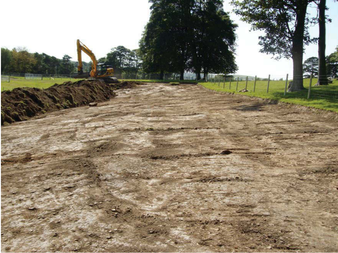
Plate 1: General shot of the easement during topsoil stripping activities