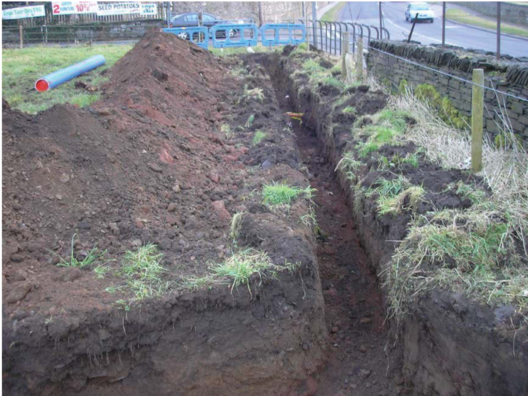
Plate 2: General shot of pipe trench in Field 2, Pennington Lane