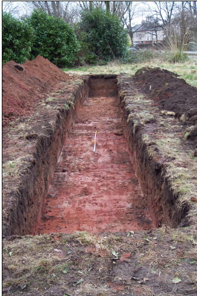
Plate 5: Plan shot of Trench 2