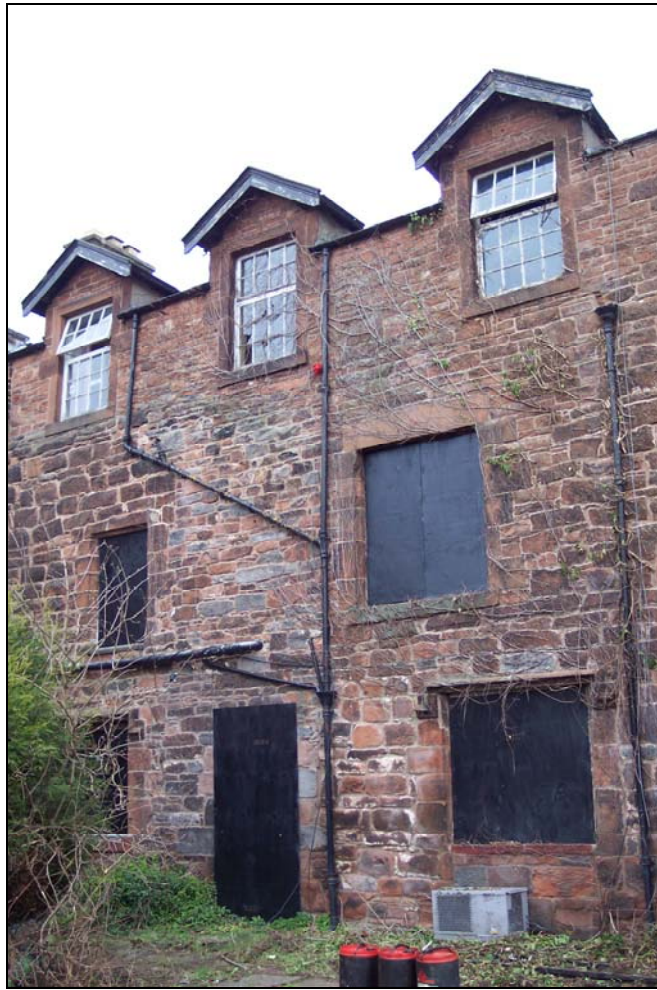
Plate 1: West-facing elevation of Two Lions Public House