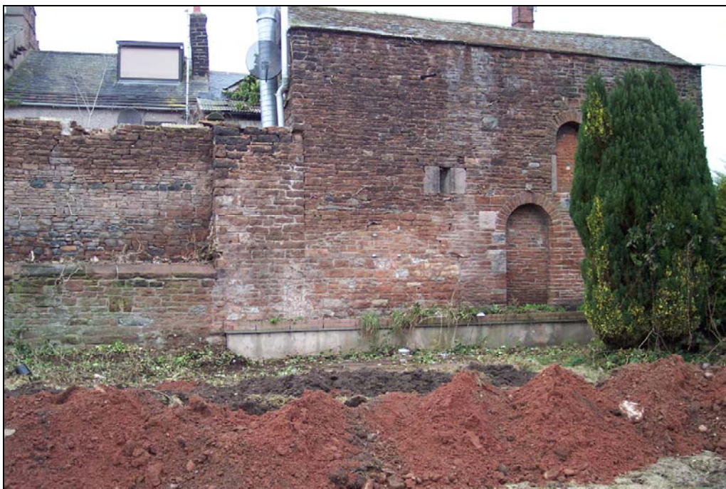
Plate 2: South-facing elevation of the barn adjacent to the Two Lions Public House