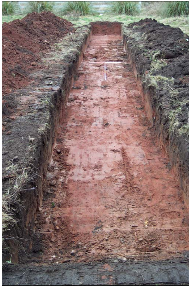
Plate 3: Plan shot of Trench 1