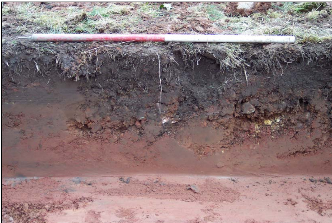
Plate 4: North-facing section of Trench 1