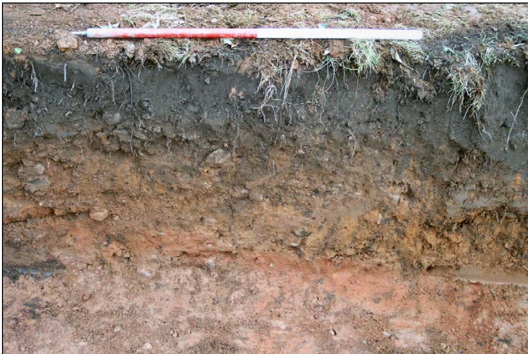
Plate 6: North-west-facing section of Trench 2