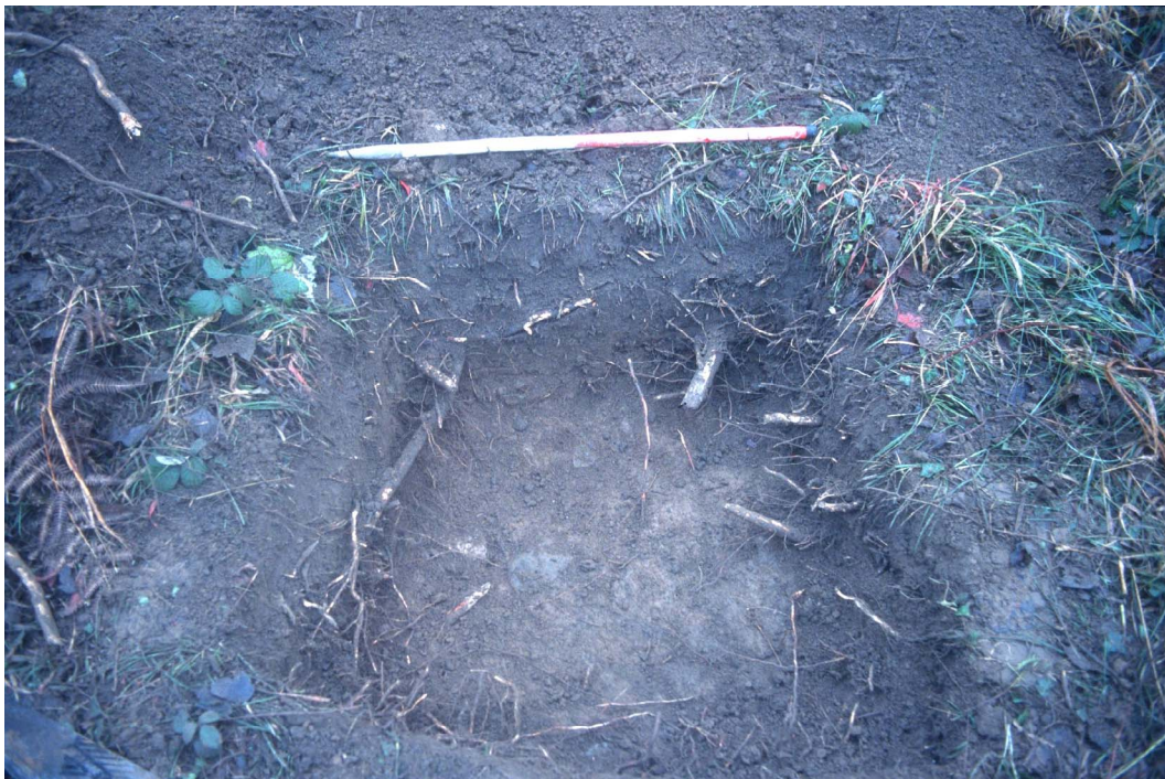
Plate 2: Test Pit 4, post-excavation