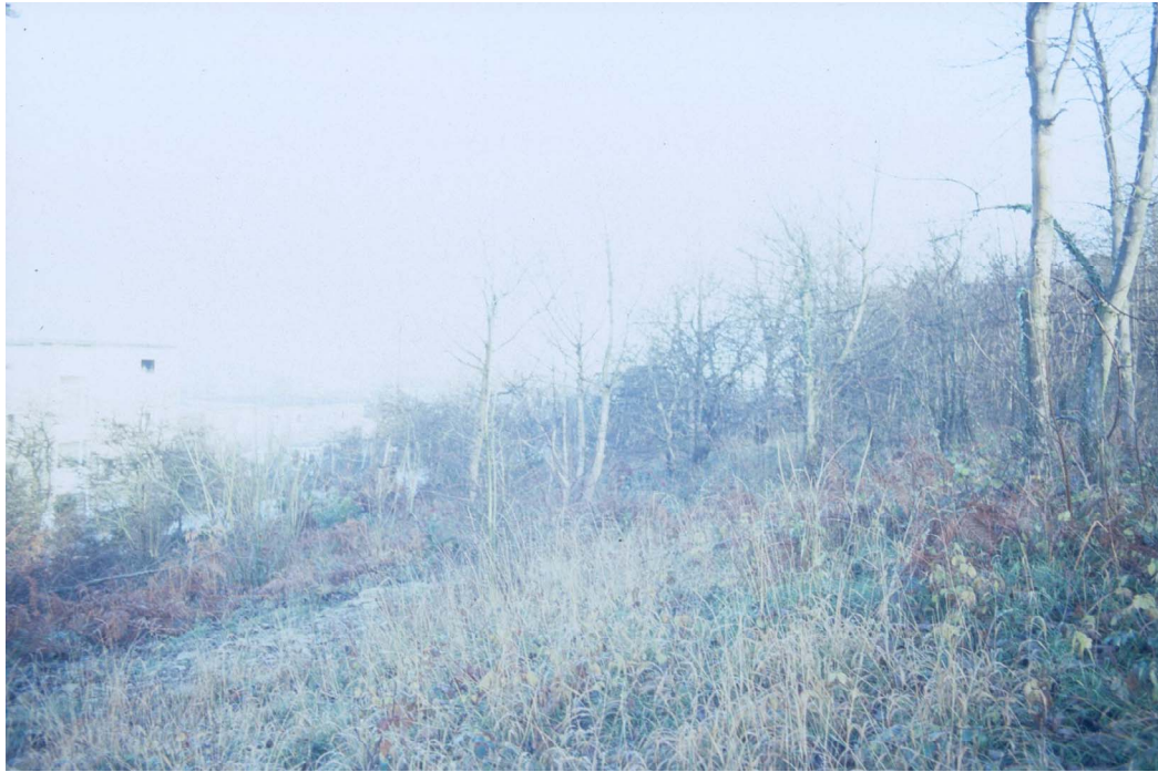
Plate 1: The wooded slope on which the evaluation took place, looking east