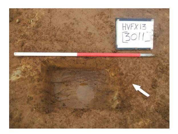
Plate 7: Ditch [3011]. Looking NE.