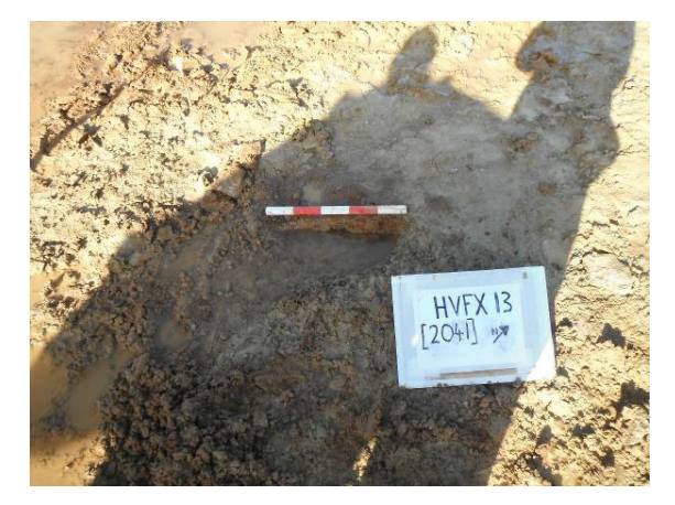
Plate 42: Post hole [2041]. Looking NW.