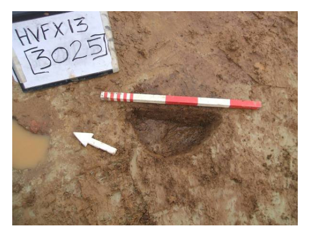
Plate 11: Post hole [3025]. Looking ENE.