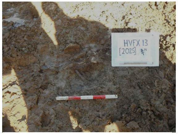
Plate 39: Hearth [2025]. Looking NNE.