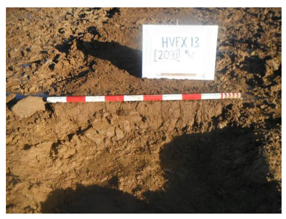
Plate 34: Enclosure ditch [2033]. Looking NE.