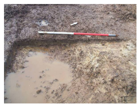
Plate 28: Spread (3101). Looking NW.