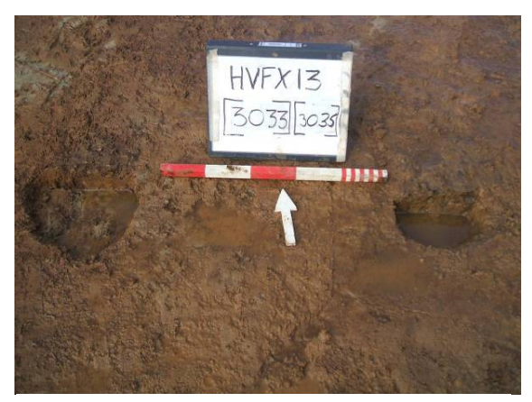
Plate 13: Post holes [3033] and [3035]. Looking N.