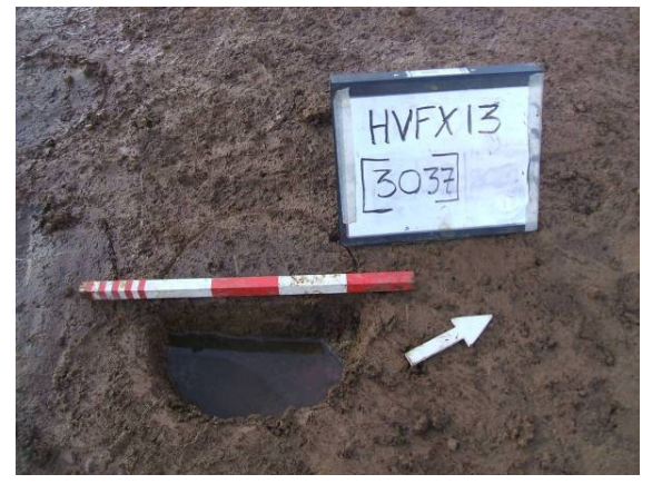
Plate 14: Post hole [3037]. Looking NW.