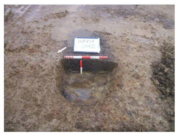
Plate 20: Pit [3061]. Looking SW.