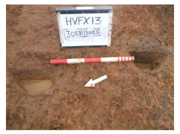
Plate 19: Post holes [3053] and [3055]. Looking ESE.