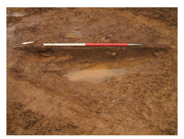
Plate 30: Pit [3105]. Looking E.