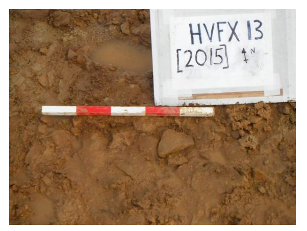
Plate 45: Post hole [2015] (very shallow). Looking N.