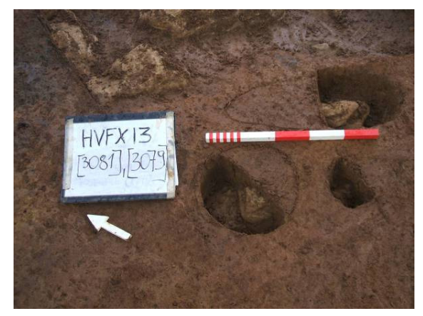
Plate 25: Post holes [3079] and [3081]. Looking NE.