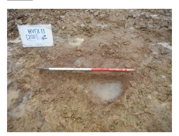
Plate 32 (above): Pit [2021]. Looking E.

Plate 33 (right): Western terminus of enclosure ditch [2003]. Looking NE.