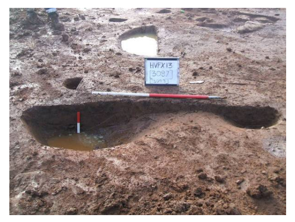
Plate 27: Pits [3097] and [3099]. Looking E.