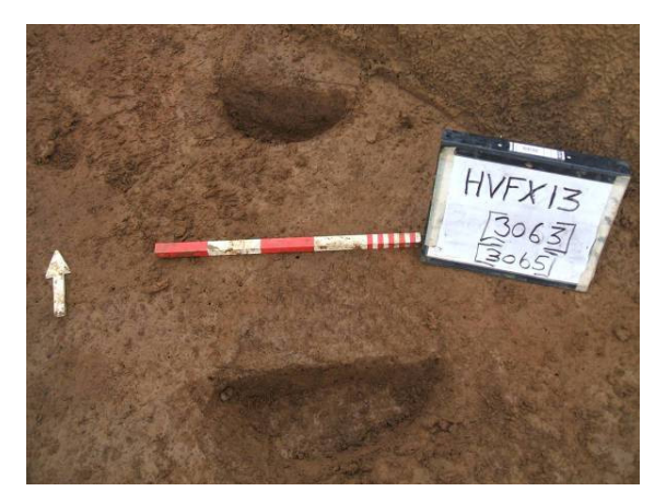
Plate 21: Post holes [3063] and [3065]. Looking N.