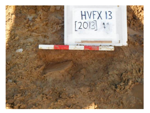
Plate 44: Post hole [2013]. Looking N.