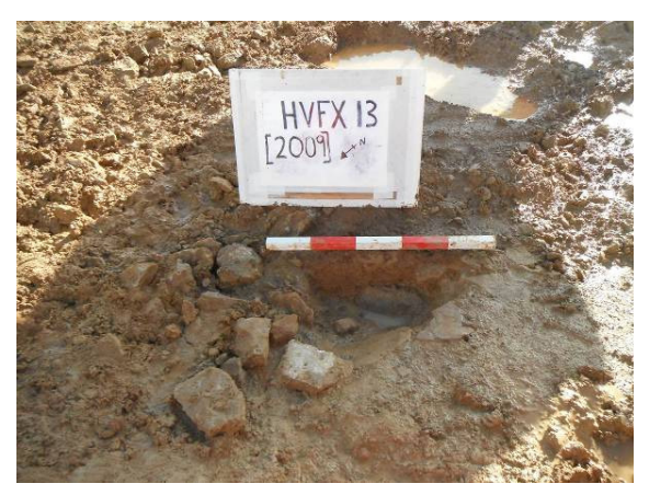
Plate 46: Post hole [2009]. Looking SE.