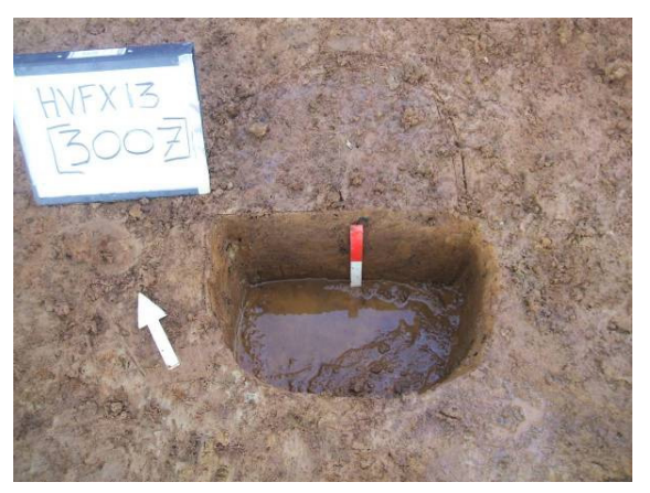
Plate 6: Pit [3007]. Looking NE.