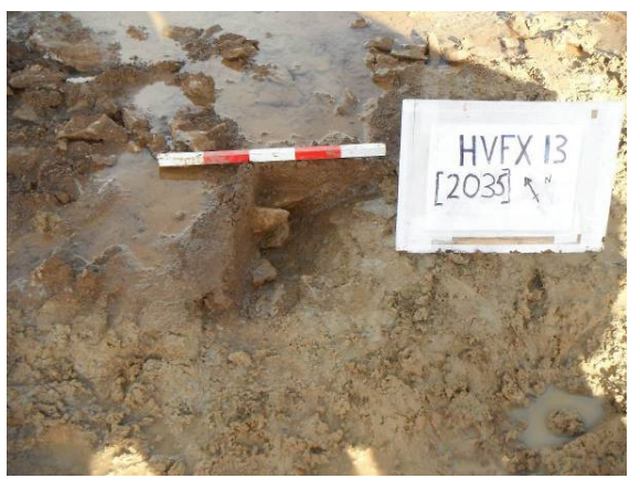
Plate 35: Eastern terminus of enclosure ditch [2035]. Looking NE.