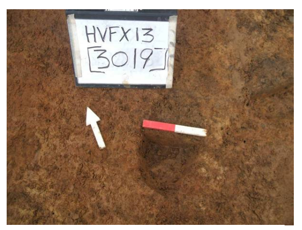
Plate 10: Post hole [3019]. Looking NNE.