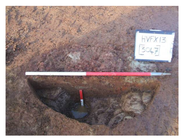
Plate 17: Pit [3047]. Looking NE.