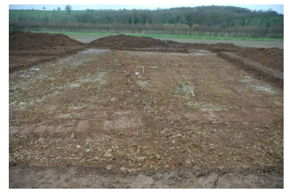
Plate 3: Pre-excavation shot of West end of Area 2. Looking S.