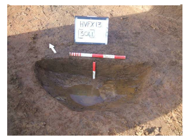
Plate 15: Pit [3041]. Looking NNE.