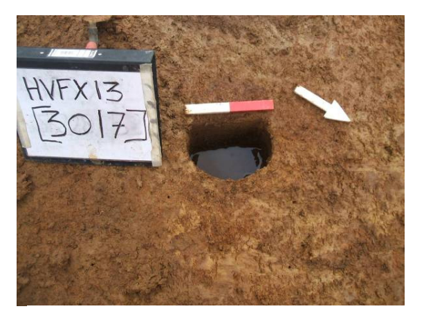
Plate 9: Post hole [3017]. Looking WSW.