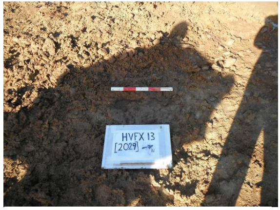
Plate 41: Post hole [2029]. Looking NW.