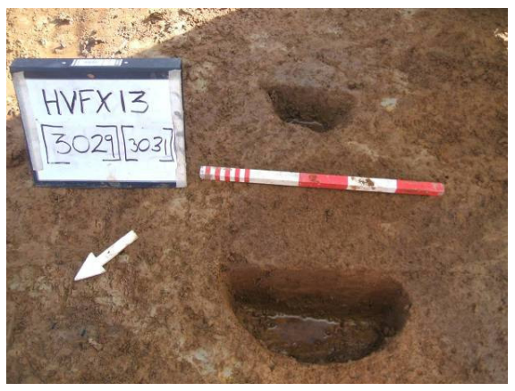
Plate 12: Post holes [3029] and [3031]. Looking SE.