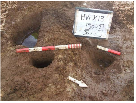
Plate 24: Post holes [3073] and [3075]. Looking WSW.