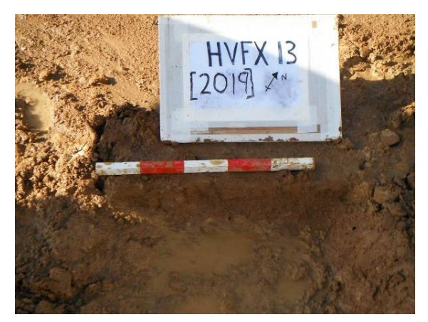
Plate 37: Furrow [2019]. Looking NE.