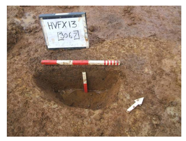
Plate 22: Pit [3067]. Looking NW.