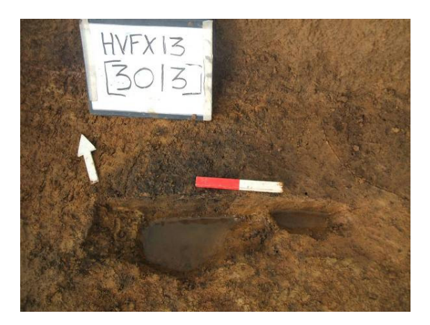
Plate 8: Post holes [3013] and [3023]. Looking NNE.