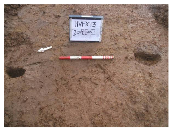
Plate 18: Post holes [3049] and [3051]. Looking ESE.