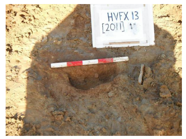
Plate 43: Post hole [2011]. Looking N.