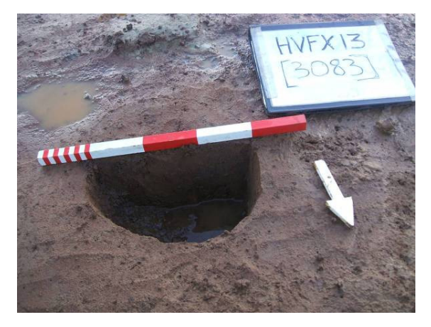
Plate 26: Post hole [3083]. Looking S.