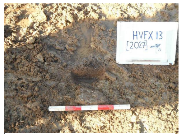
Plate 40: Post hole [2027]. Looking WNW.