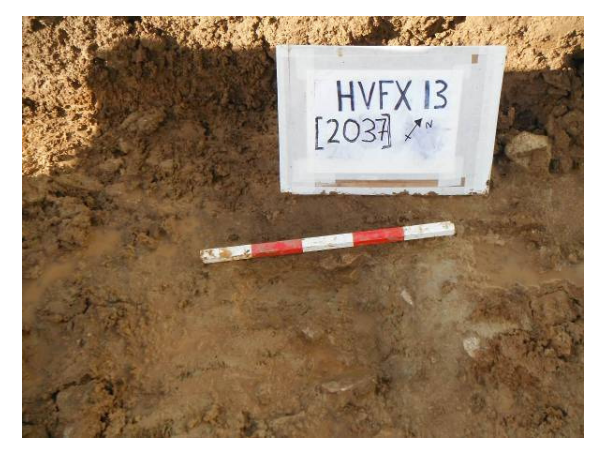
Plate 36: Furrow [2037]. Looking NW.