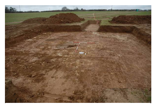
Plate 1: Pre-excavation shot of Area 1. Looking N.