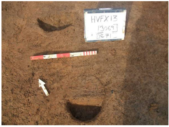
Plate 23: Post holes [3069] and [3071]. Looking NNE.