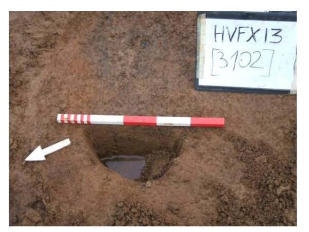
Plate 29: Pit [3102]. Looking SE.