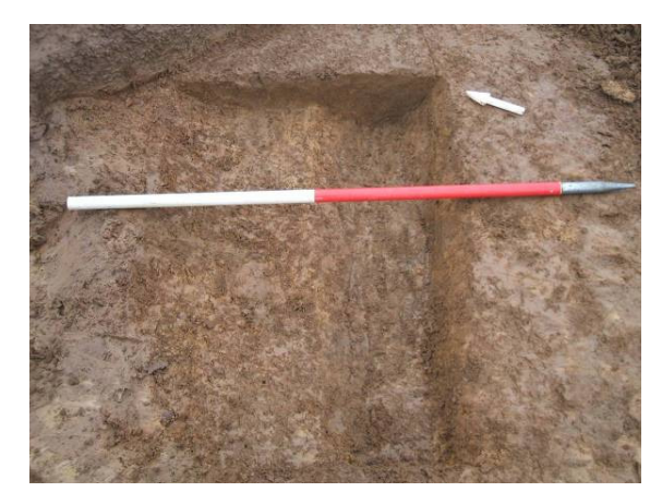
Plate 31: Ditch [3107]. Looking NE.