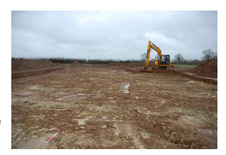
Plate 4: Working shot of excavation of East end of Area 2. Looking E.