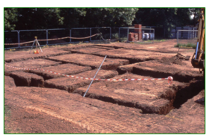
Plate 12 (left): House plot 7 on completion of the foundation trenches, looking south-east.