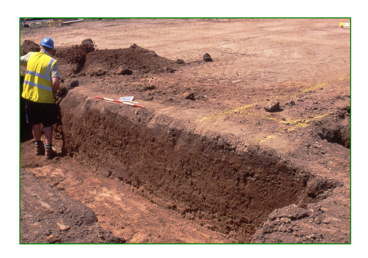
Plate 11 (right): The undamaged part of sample section G-H in house plot 7, looking south-west: no furrows are visible.