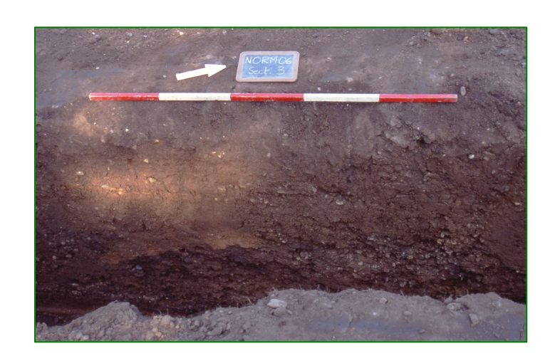
Plate 9 (right): Sample section E-F in house plot 7, looking west-north-west, showing the remnant topsoil overlying subsoil 002.