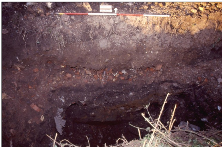
Plate 3 (left): Trench 2, looking east.