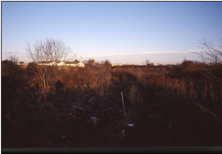
Plate 1 (left): General view of the development site, looking east from the area of Trench 1