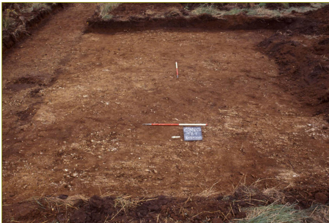
Plate 11: Trench 9 extension. Looking East.