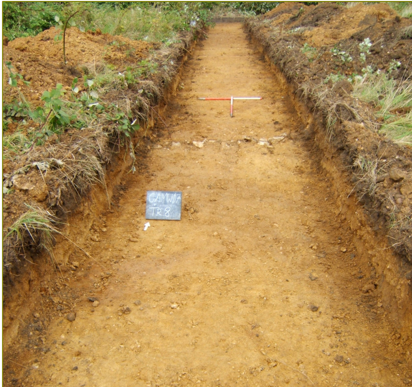
Plate 9: Trench 8. Looking North.