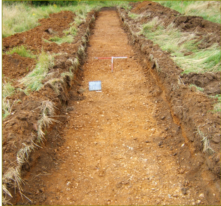
Plate 13: Trench 11. Looking North.