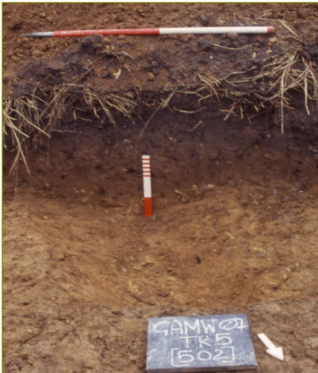
Plate 14: Ditch [502]. Looking South/South/West.