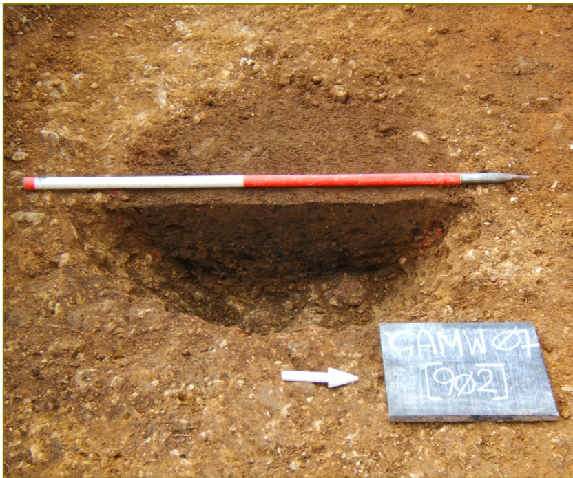
Plate 16: Pit [902]. Looking East.