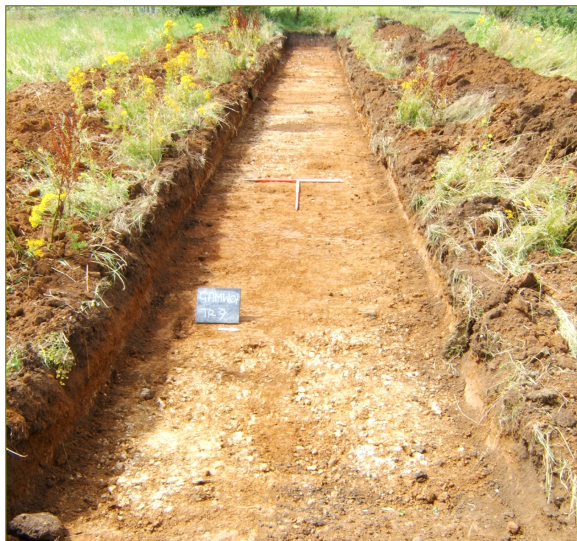
Plate 10: Trench 9. Looking West.