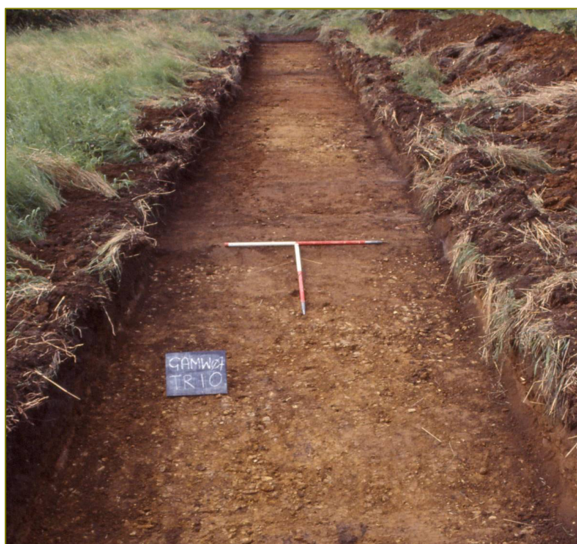
Plate 12: Trench 10. Looking North.