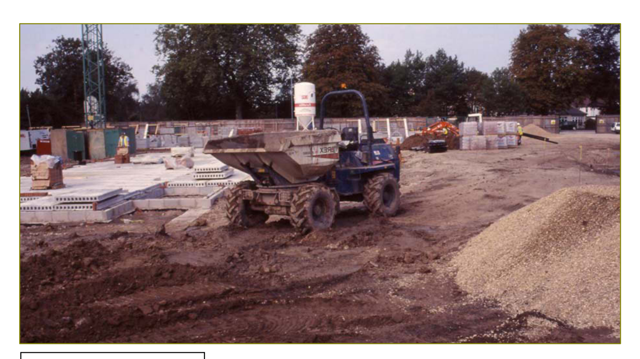
Plate 1: General site