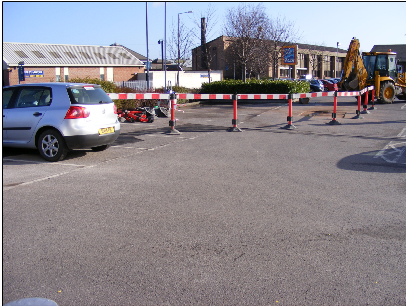
Plate 1: General view of Aldi store and car park looking north