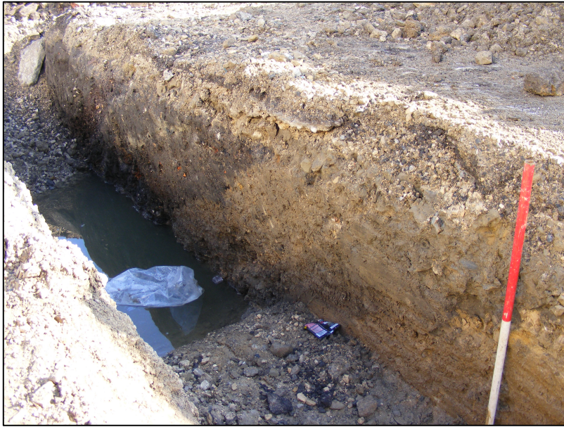
Plate 3: Footings trench for extension showing tip-lines looking east (Section A-B)