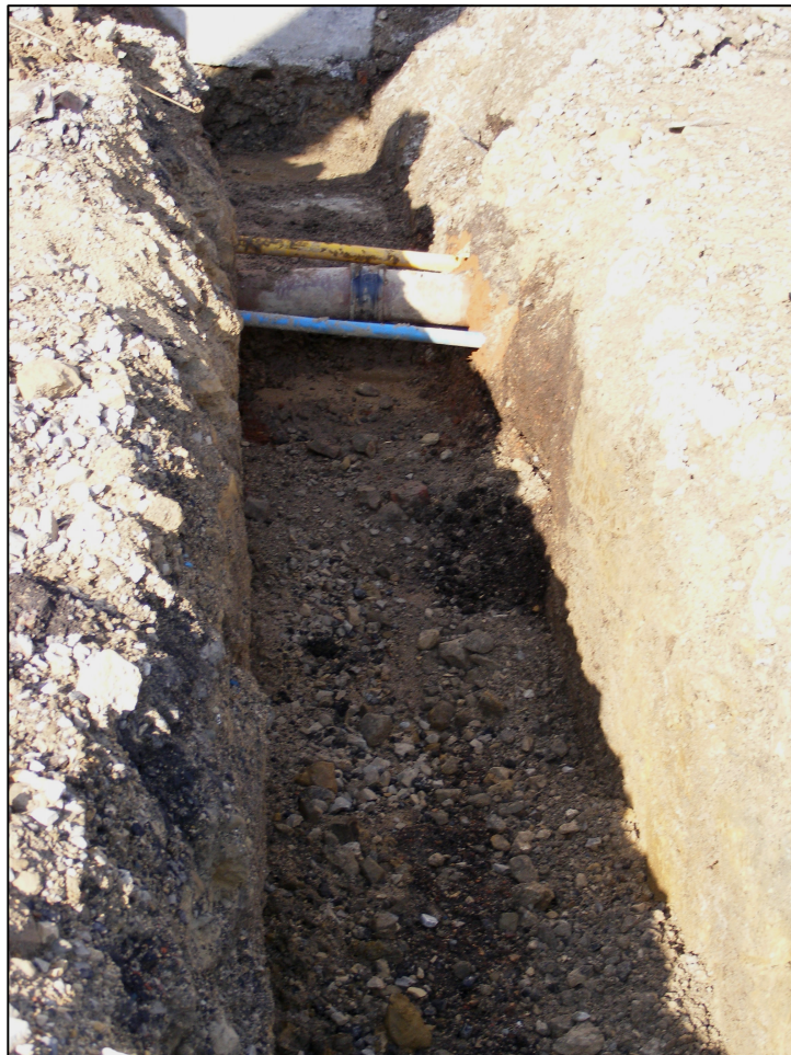
Plate 4: General view of footings trench looking north