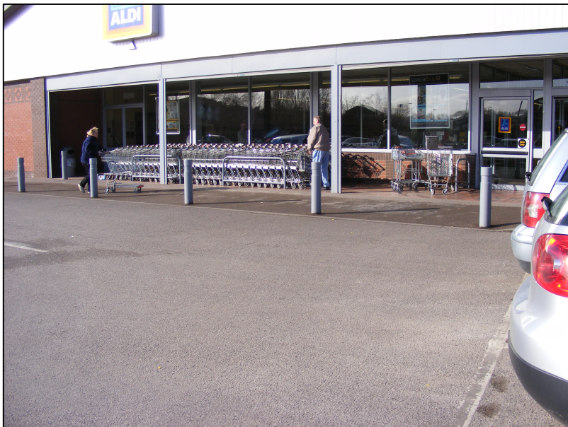
Plate 2: Location of proposed extension looking west