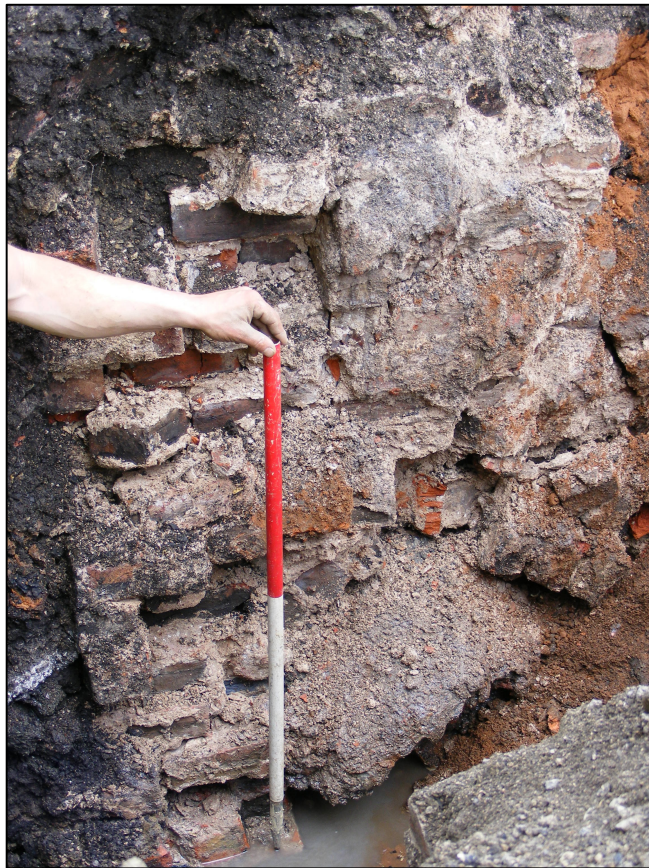
Plate 5: Relict wall/foundations (114) Looking north (Section E-F)