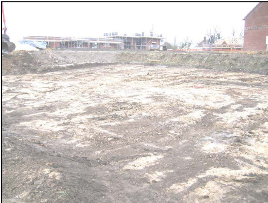
Plate 2: General view of Area 1 looking south