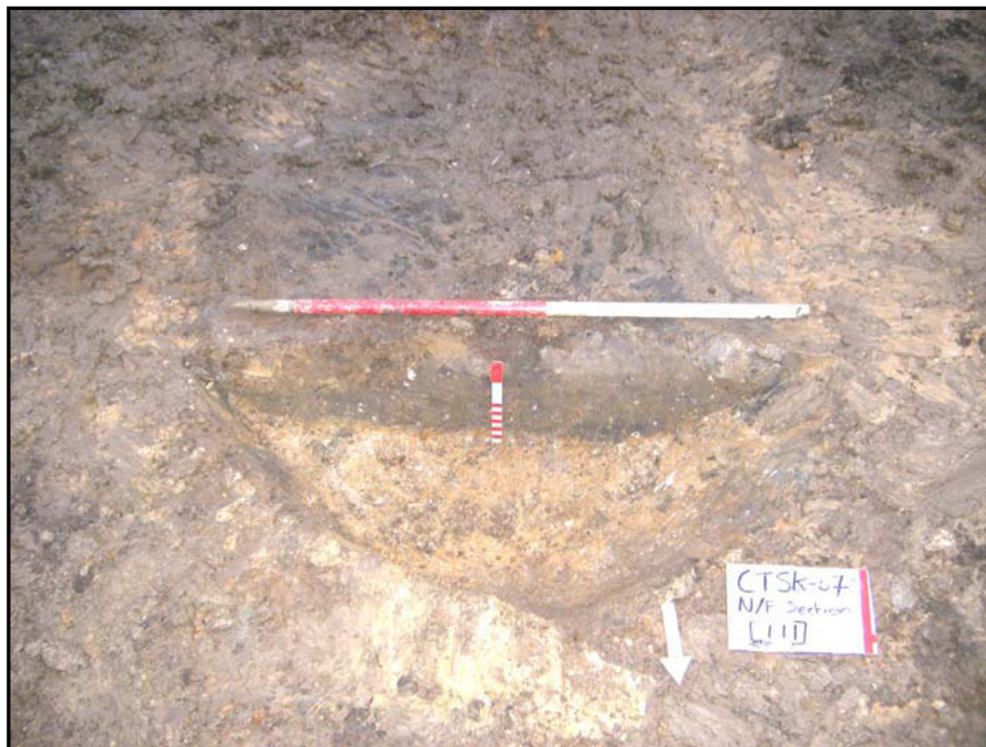
Plate 4: Pit [111], Section 5, looking south