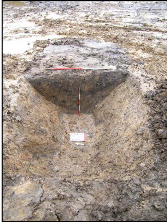
Plate 5: Feature [109], Section 4, looking east