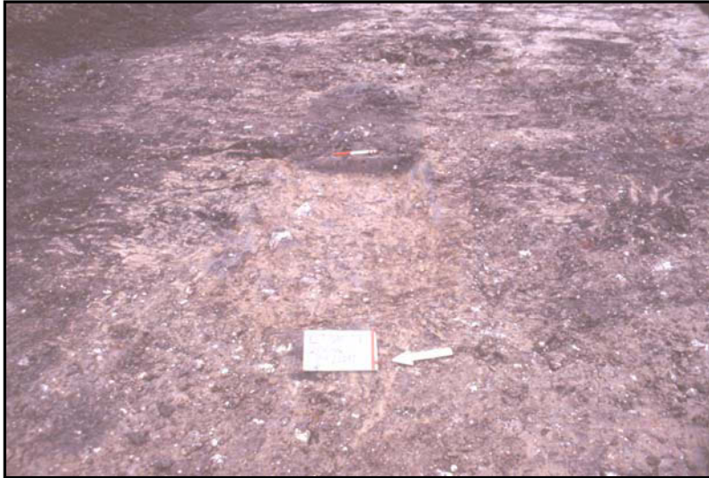
Plate 7: Pit [103], Section 2, looking east