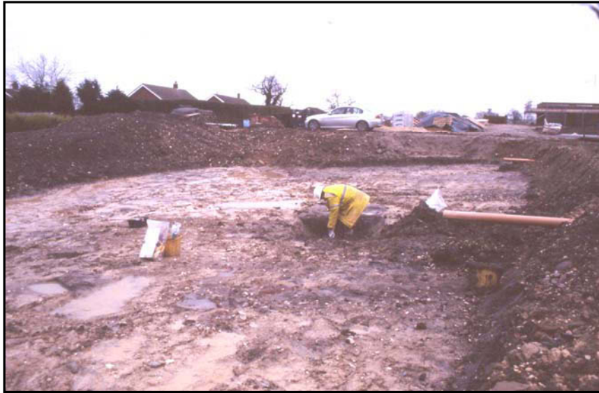
Plate 3: Working shot showing excavation of feature [109] looking northeast