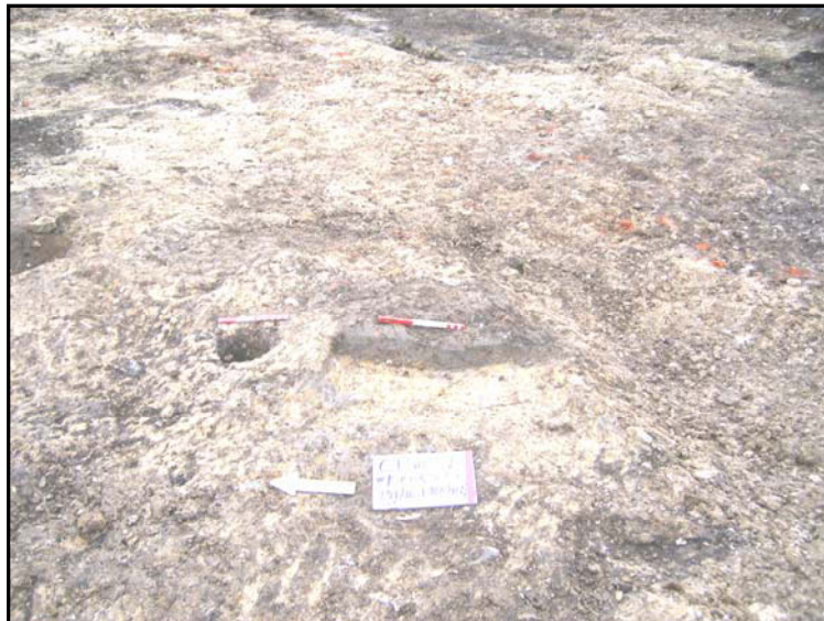
Plate 6: Pit [105] and modern post-hole [107] looking east