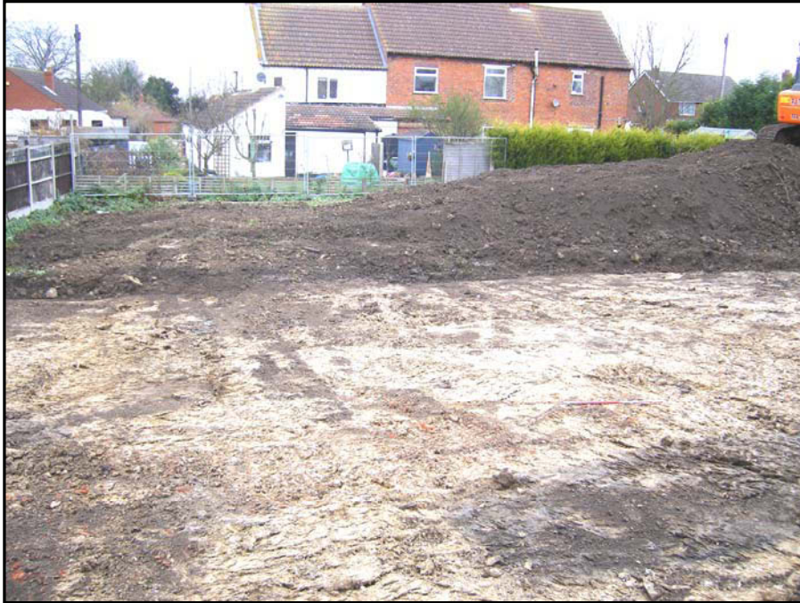
Plate 1: General view of Area 1 showing pit [109] in the foreground looking north