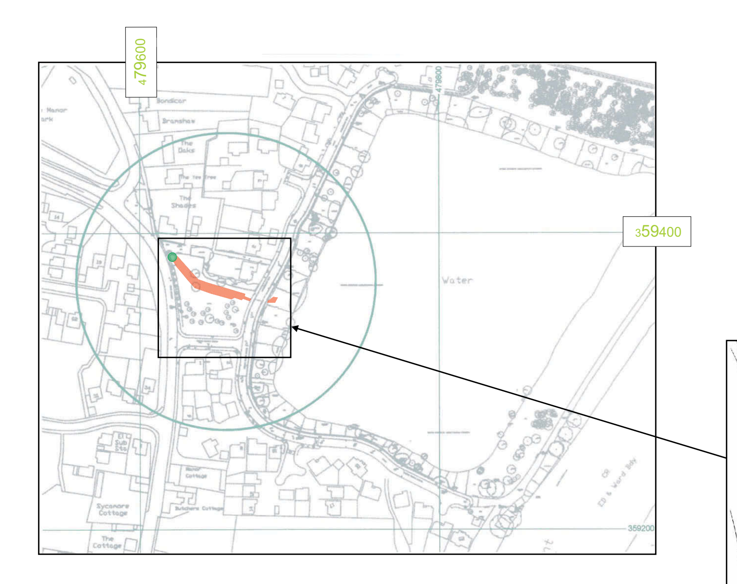
Fig.2: General Site Location at Scale 1:2500 (above). The area of hand excavation is shaded green, and the area stripped for the pipe trench easement is shaded in red.

Detailed Site Location at Scale 1:500 (right). Area 1 (hand excavation) is outlined in solid green, Area 2 (hand excavation) is outlined in dashed green: this area is enlarged in Fig. 3. The extent of the stripped area for the pipe trench easement is outlined in solid red, while the pipe trench itself is outlined in blue. The shaded area was not covered by the archaeological brief. Drawings taken from Scott Wilson 2008.