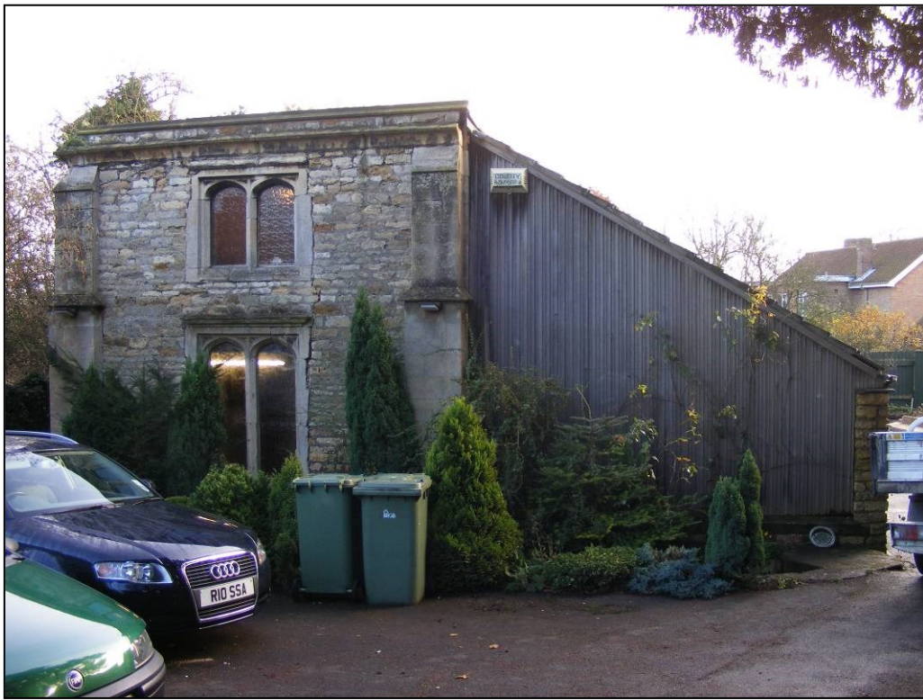
Pl. 1 West elevation of The Vinery, with attached garage structure to the south. Looking east down the slope.