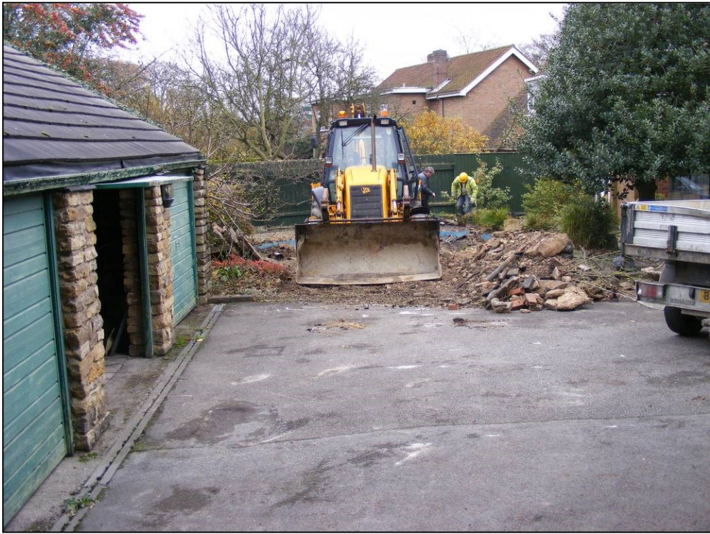
Pl. 3 Location of the new garage site (looking east past the existing garages at the south side of the Vinery).