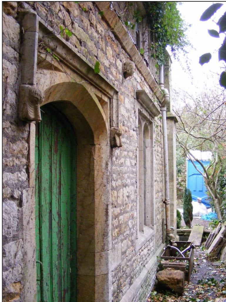
Pl. 2 North elevation of The Vinery (looking west towards Northgate). Note the carved stones near the door.