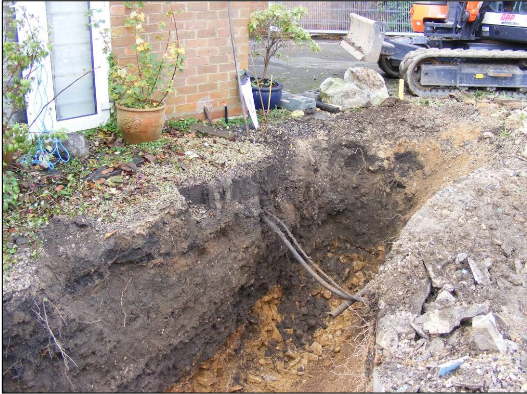
Pl. 5 Service trench beside 'Stonegarth' (looking south-east).