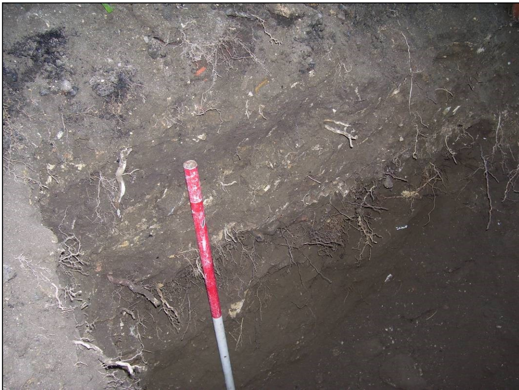
Pl. 8 Soil deposits visible in the south face of the pumping chamber pit (looking south-west, scale divisions 0.5m).