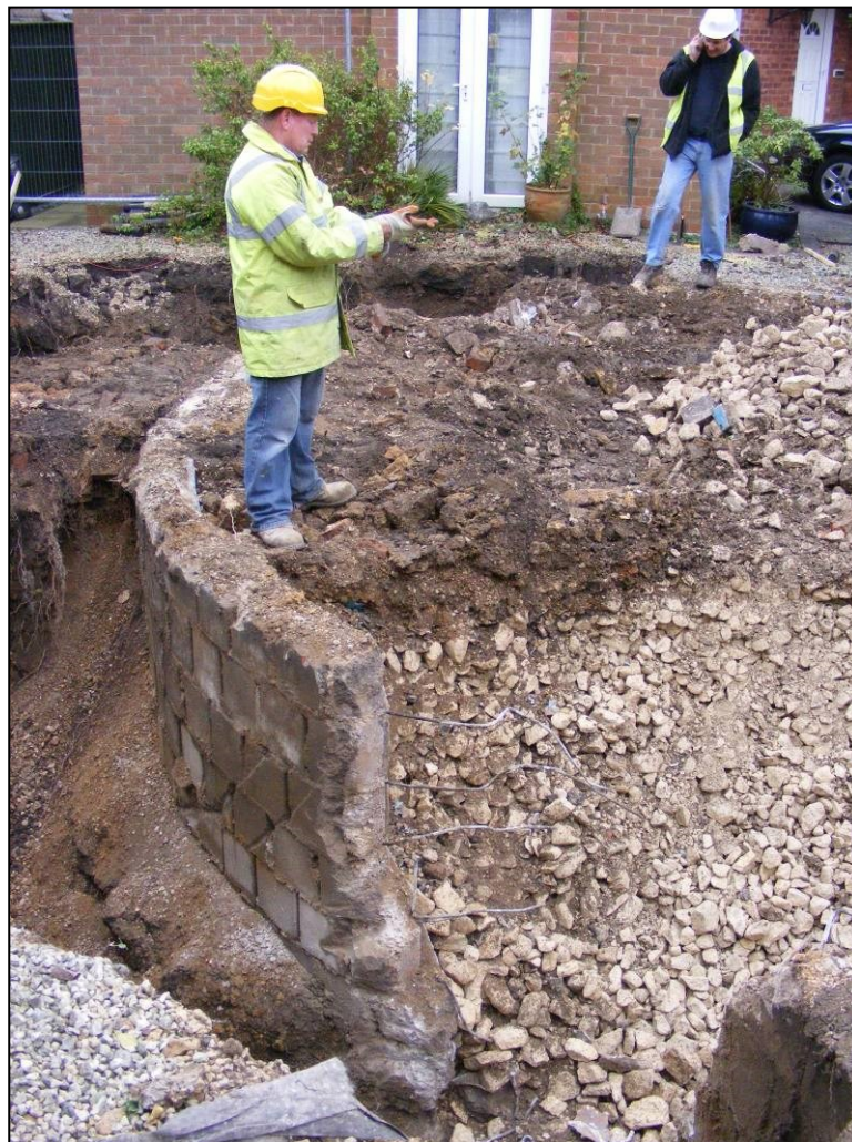
Pl. 4 Concrete wall of the backfilled swimming pool (looking south-east towards 'Stonegarth').