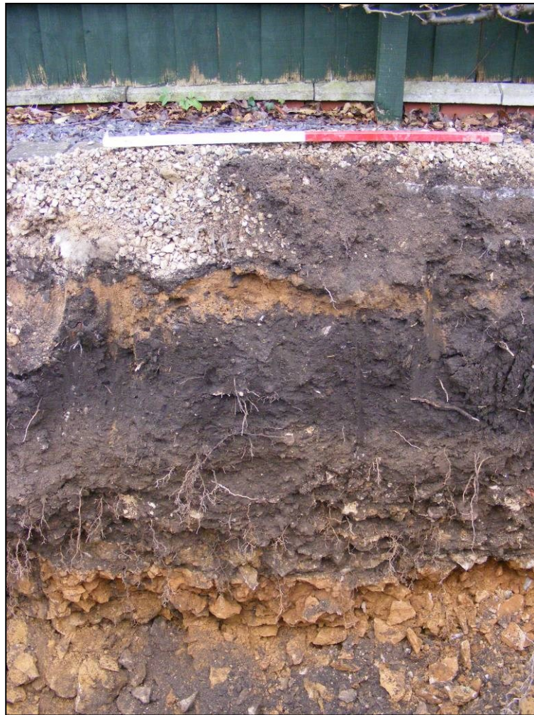
Pl. 6 Deposits visible in the eastern foundation trench (looking north-east, scale 1m).