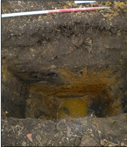
Pl. 2 North face of the contractors' Test Pit 2, showing soil with rubble overlying buried topsoil with naturally deposited sandy gravel and clay deposits below. (Looking north, scale 1m).