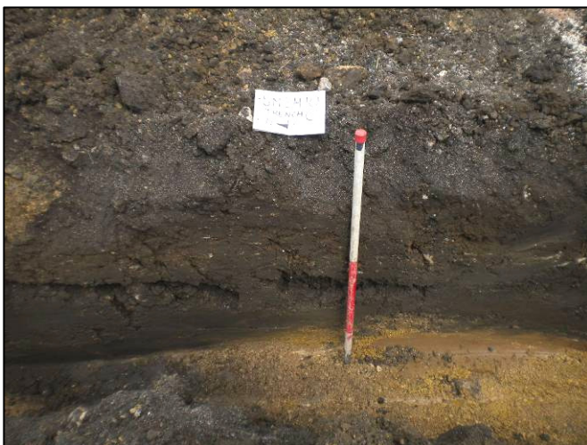
Pl. 7 Deposits visible in the eastern face of Trench 6. (Looking east, scale 1m).