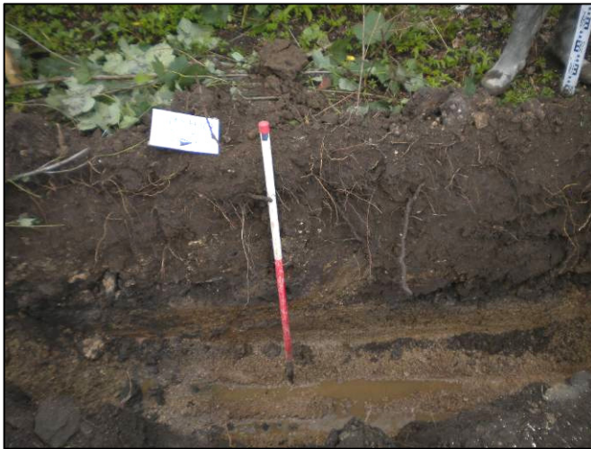
Pl. 3 Deposits visible in the western face of Trench 1 (the western foundation trench), towards the southern end of the site. Darker deposits survived to a greater depth at the northern end where the ground was higher. (Looking west, scale 1m).