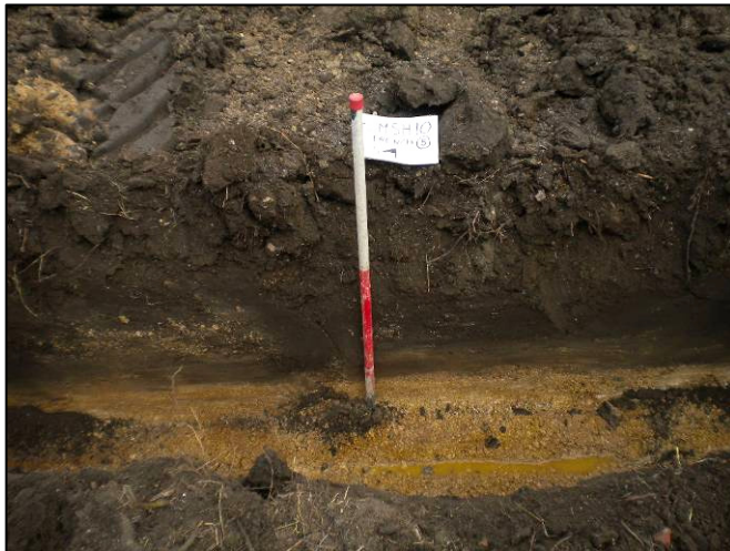
Pl. 6 Deposits visible in the eastern face of Trench 5 (the eastern foundation trench). (Looking east, scale 1m).