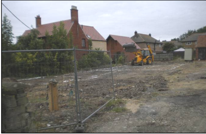
Pl. 1 View of the development site, with the new foundation trench positions marked in white. (Looking north-west from the Main Street site entrance).