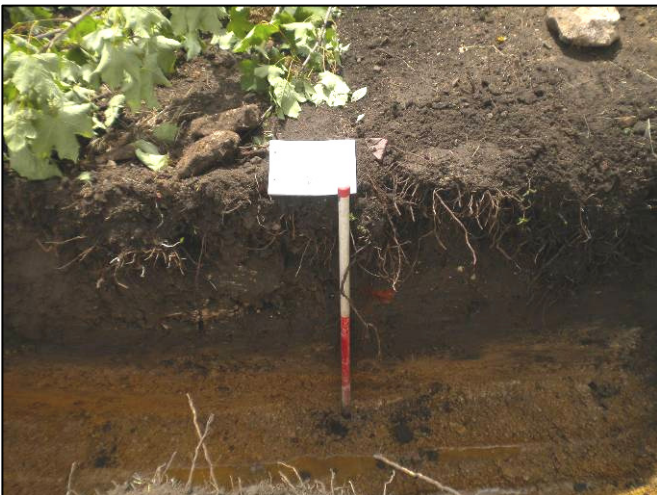
Pl. 4 Deposits visible in the southern face of Trench 2 (the southern foundation trench). (Looking south, scale 1m).