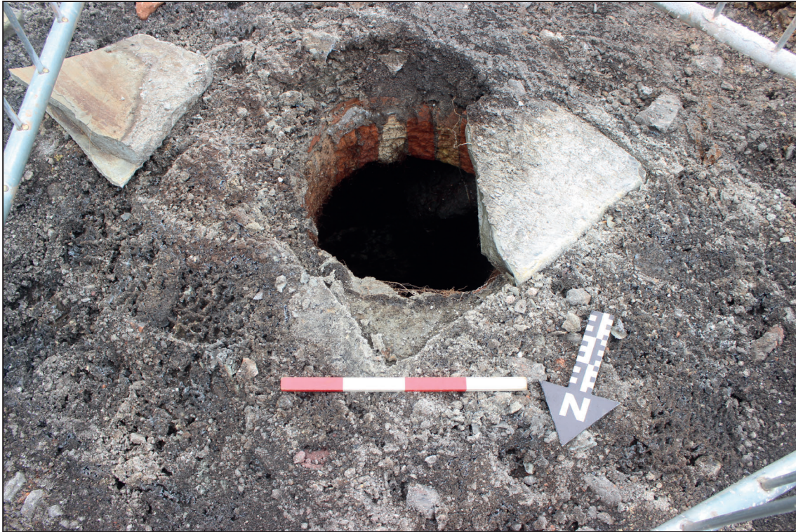
Concrete well cap 601, looking south (0.4m scale)