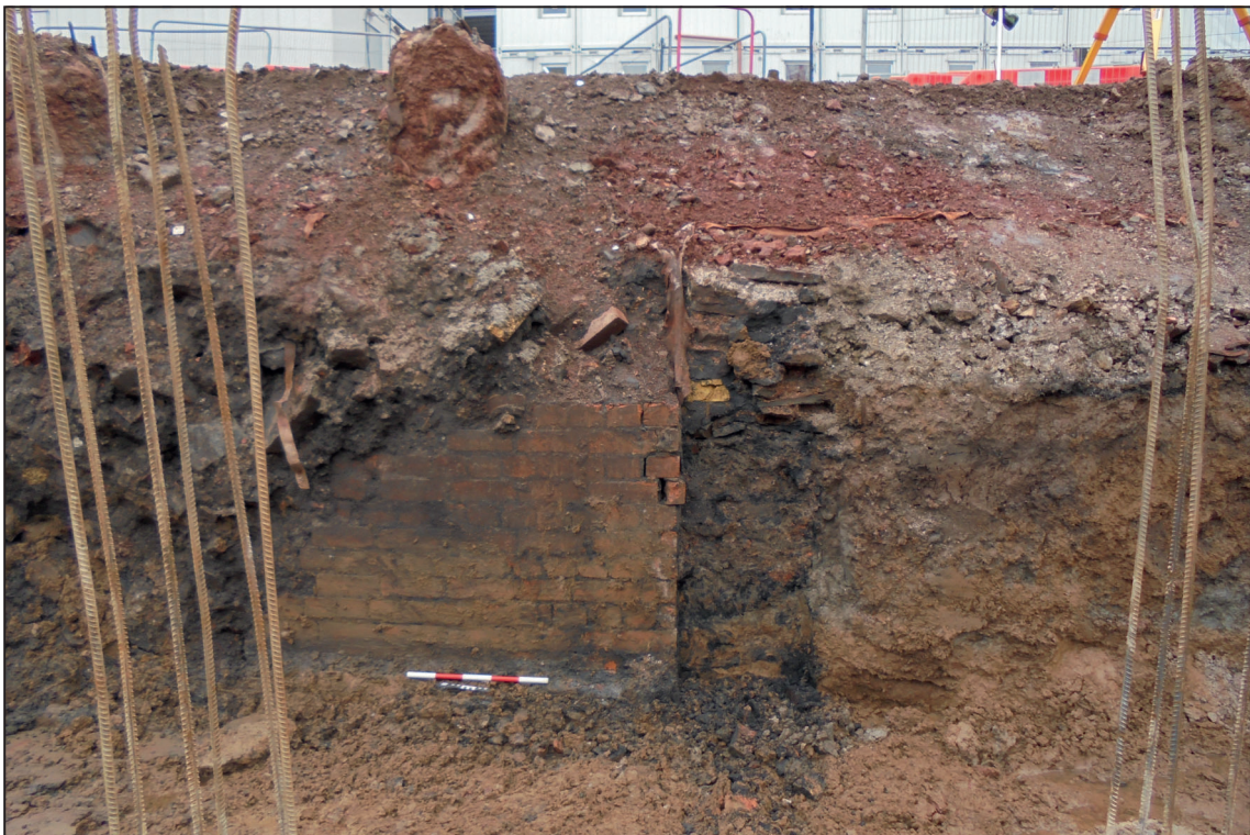
Brick foundation wall 703, foundation cut 707 and stone wall 704, looking north-east (0.5m scale)