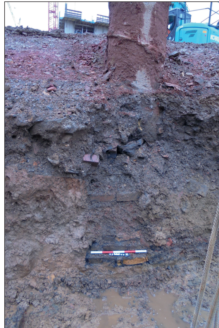
Foundation wall 708, looking south-west (0.5m scale)