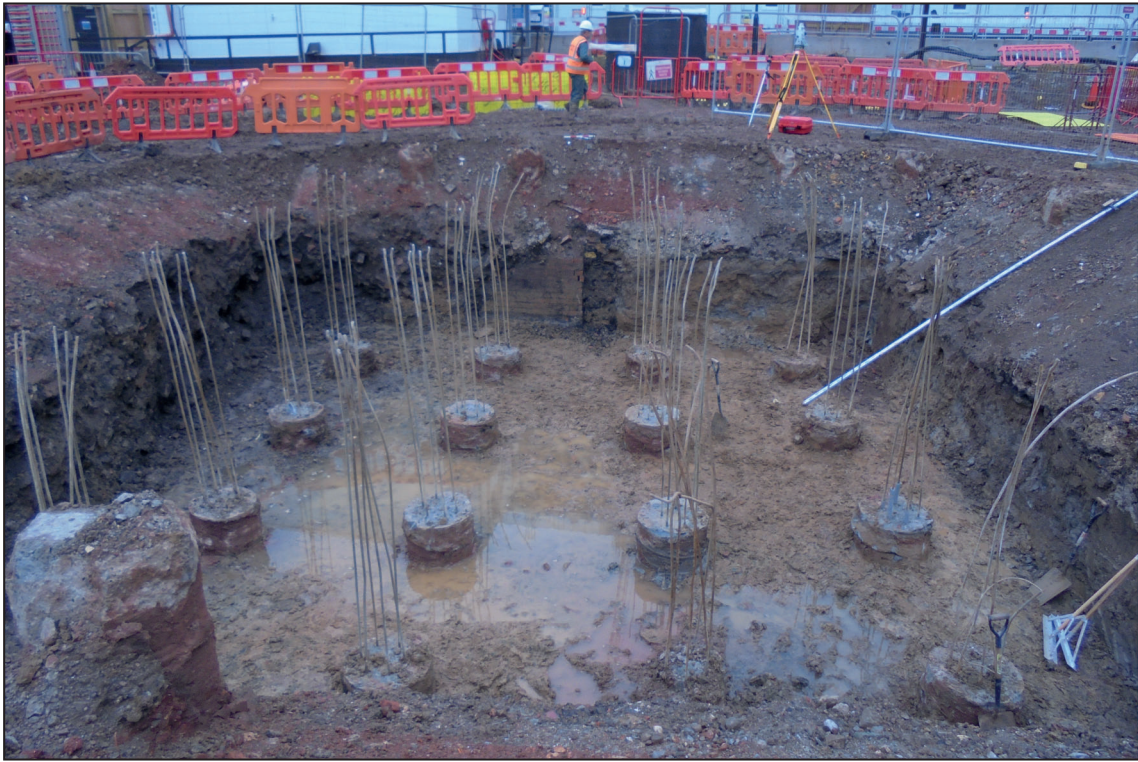
Trench 7, looking north-east (0.5m scale)