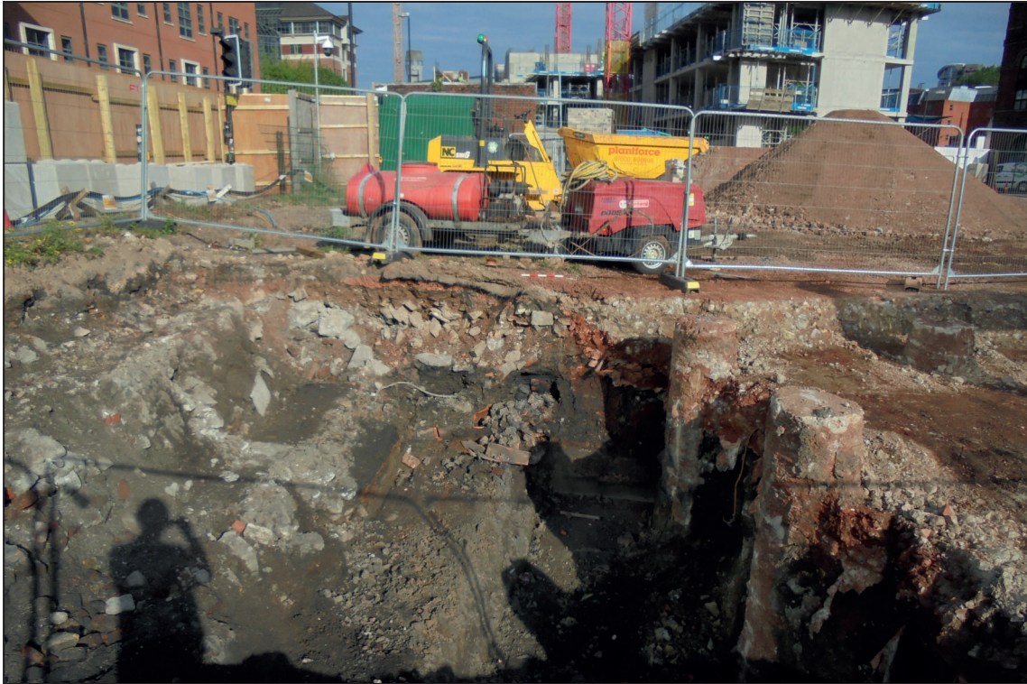
Trench 5, foundation wall 505, looking west (0.5m scale)