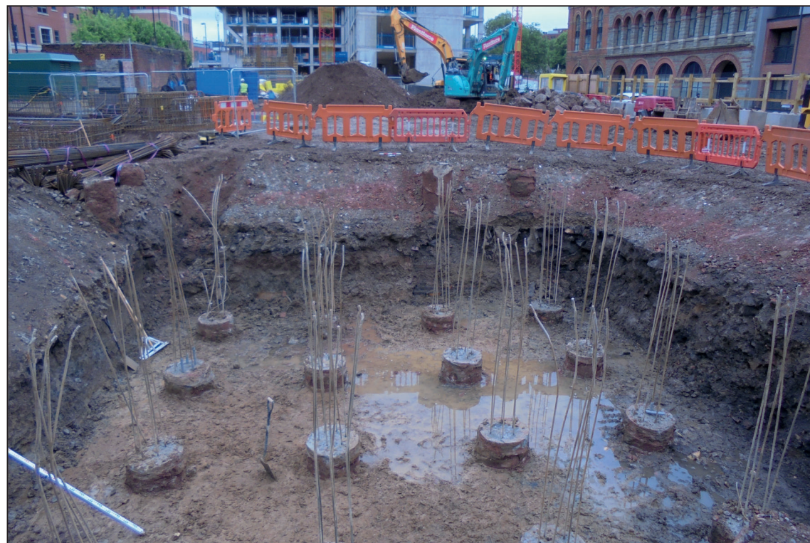
Trench 7, looking south-west (0.5m scale)