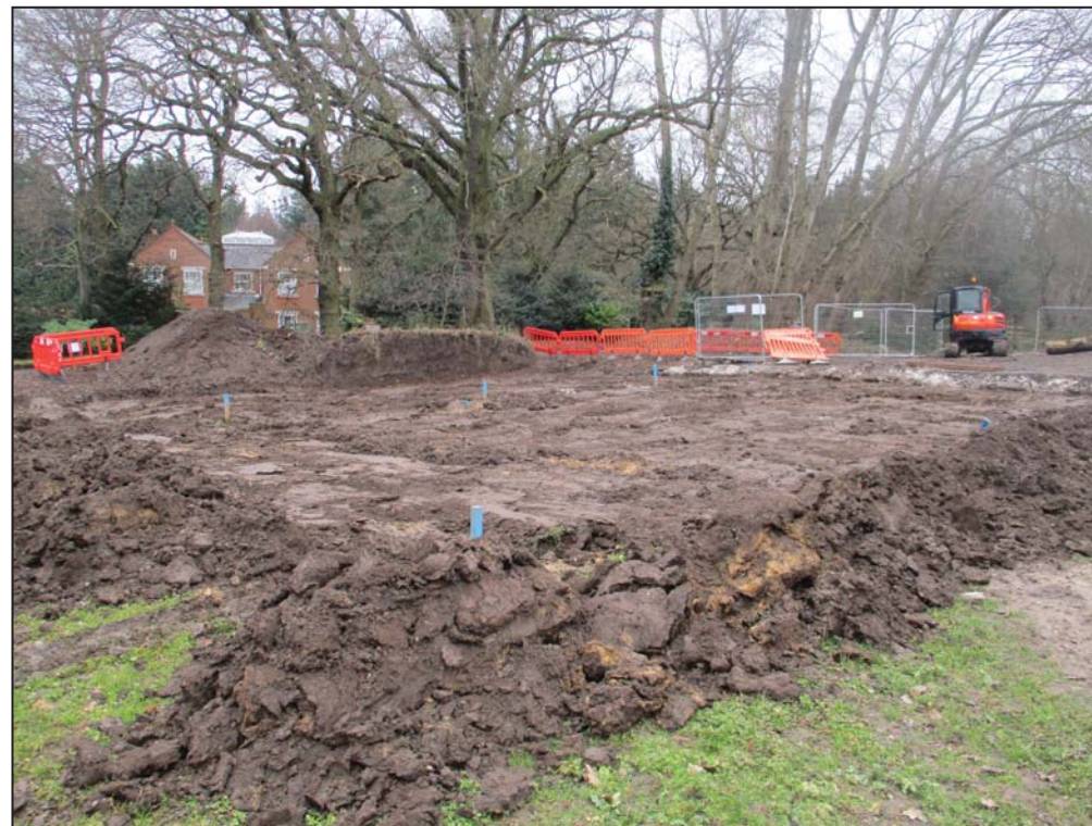
Working shot 3