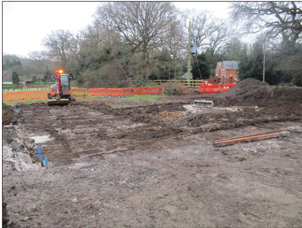
Working shot 1