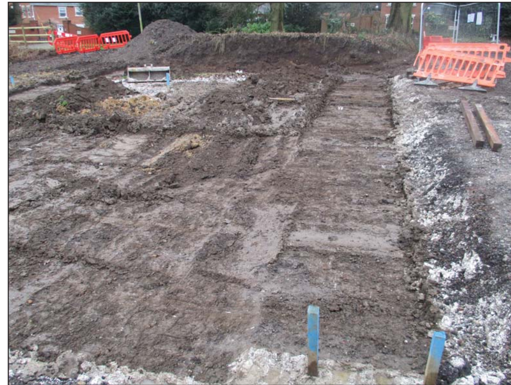
Working shot 2