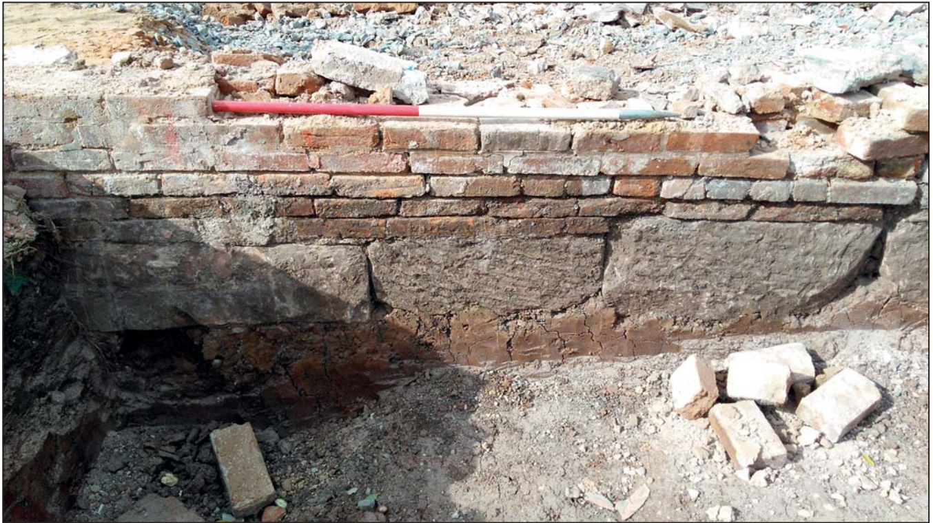
Wall foundation 1019 and wall 1003/1006, looking north-west (1m scale)