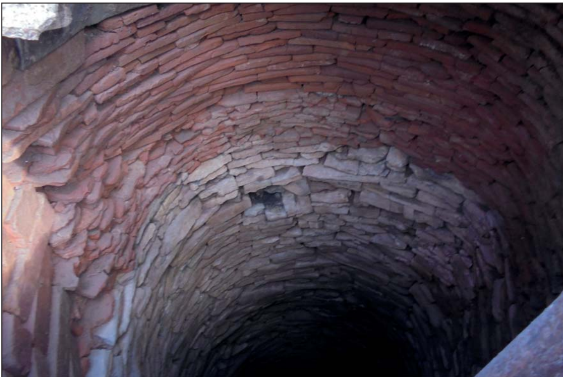
Well 130, showing sandstone and brick construction