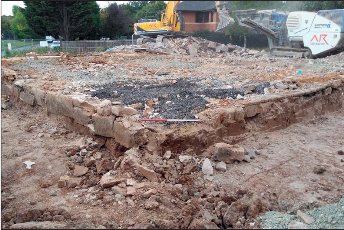
Remains of historic farmhouse post demolition/ground reduction, looking south-west (scale 1m)