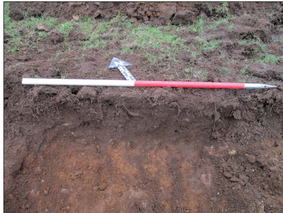
South-west facing section of Area 2 (scale 1m)