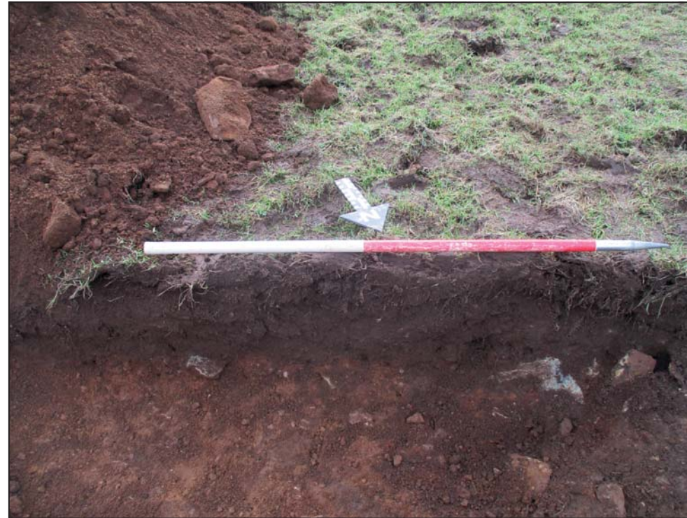
North-east facing section of Area 1 (scale 1m)