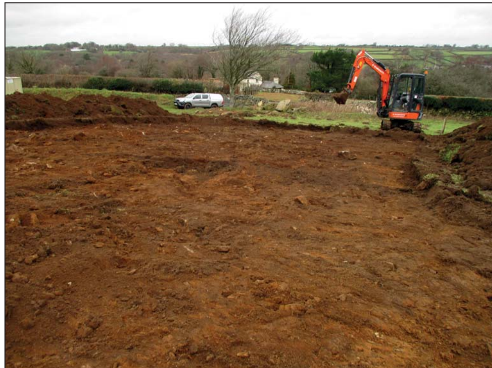
Area 2 stripped