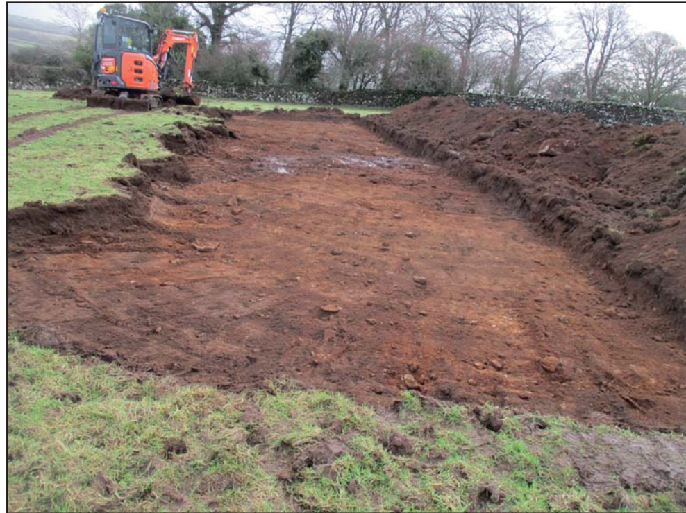
Area 1 stripped