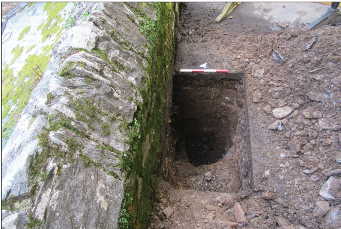
Pit 3, looking east (0.4m scale)