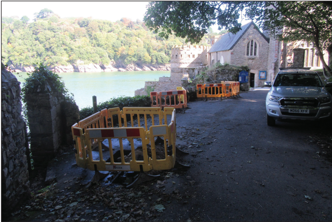
General view of monitored groundworks, looking east