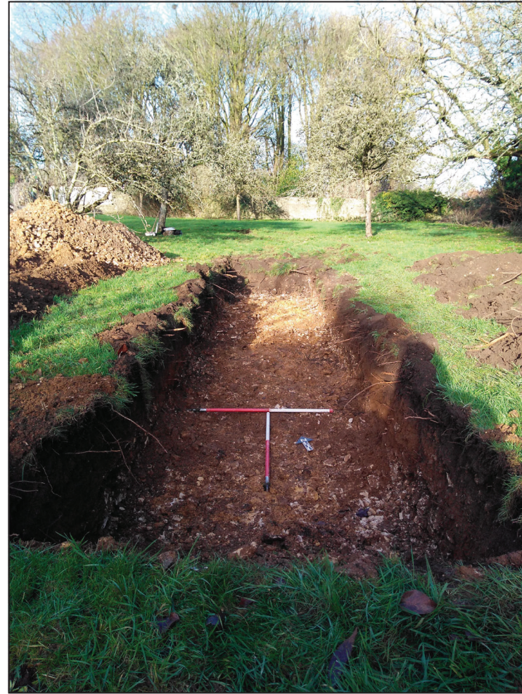
Trench 2, looking north east (1m scales)