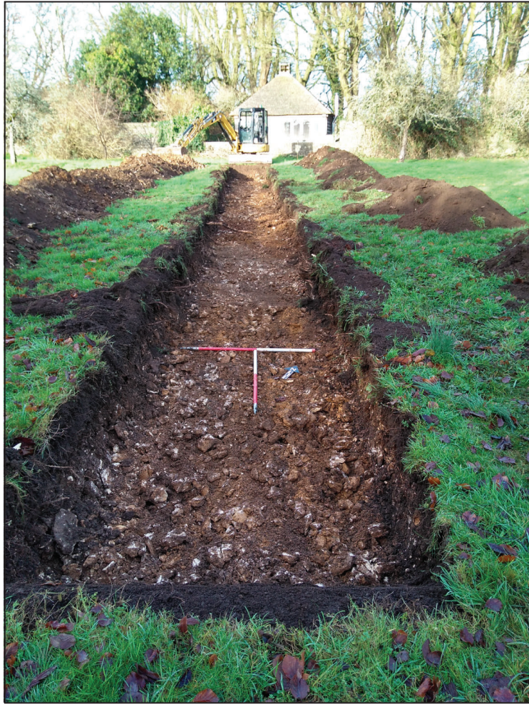
Trench 1, looking north west (1m scales)