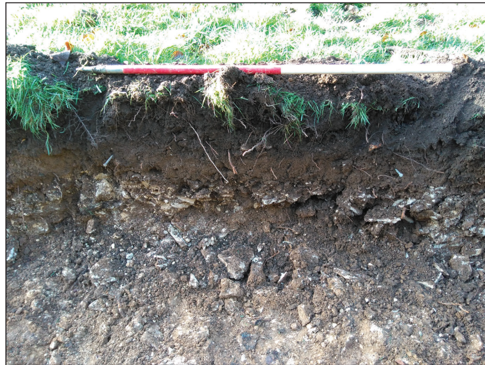
Trench 1, representative section (1m scale)